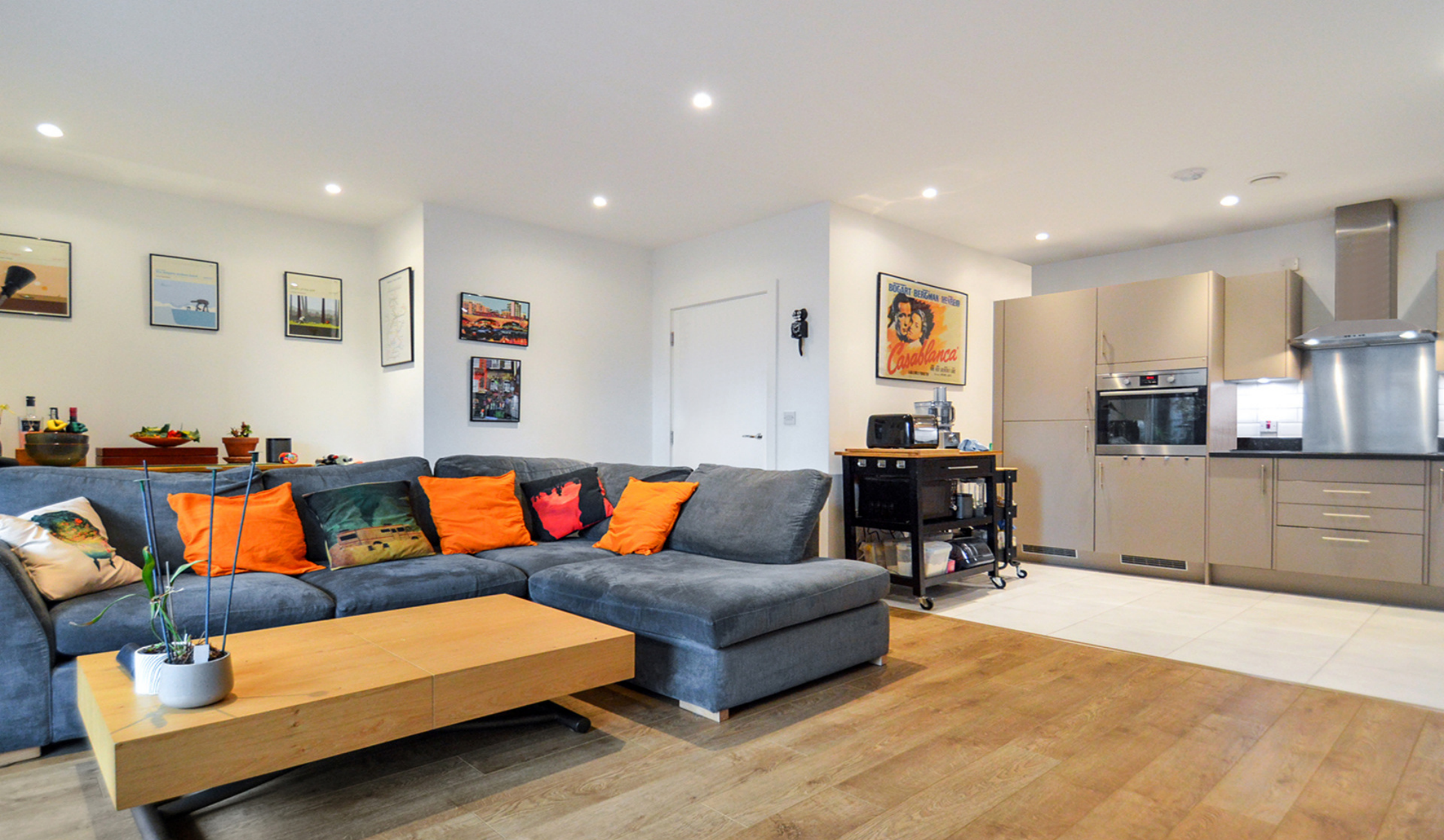
METTALICA COURT E14 2 bedroom apartment