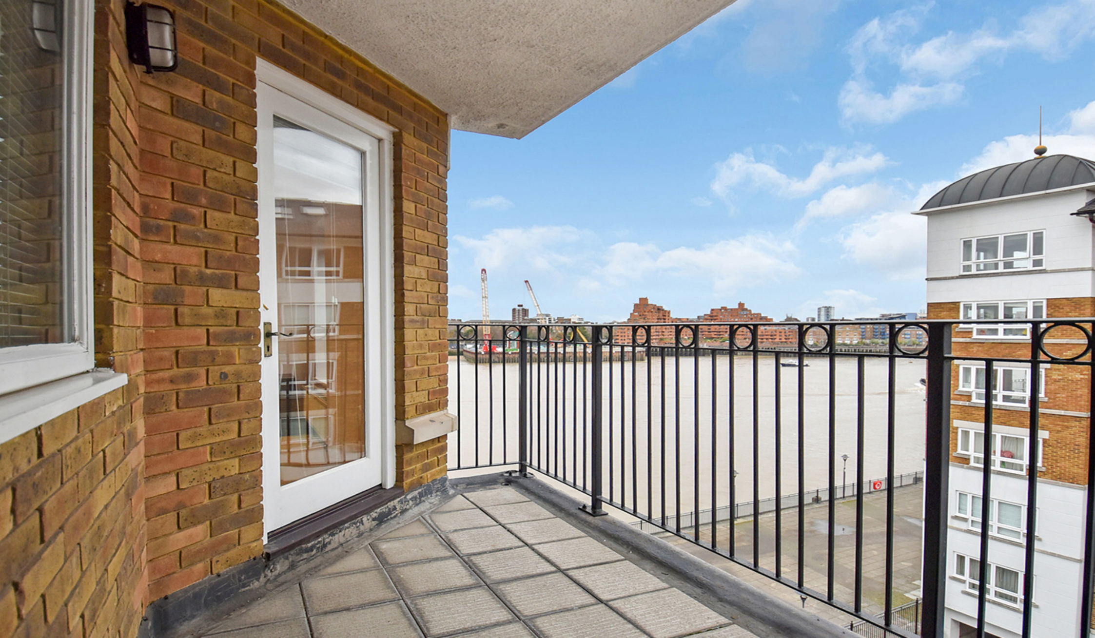
WOOLCOMBES COURT SE16 2 bedroom apartment