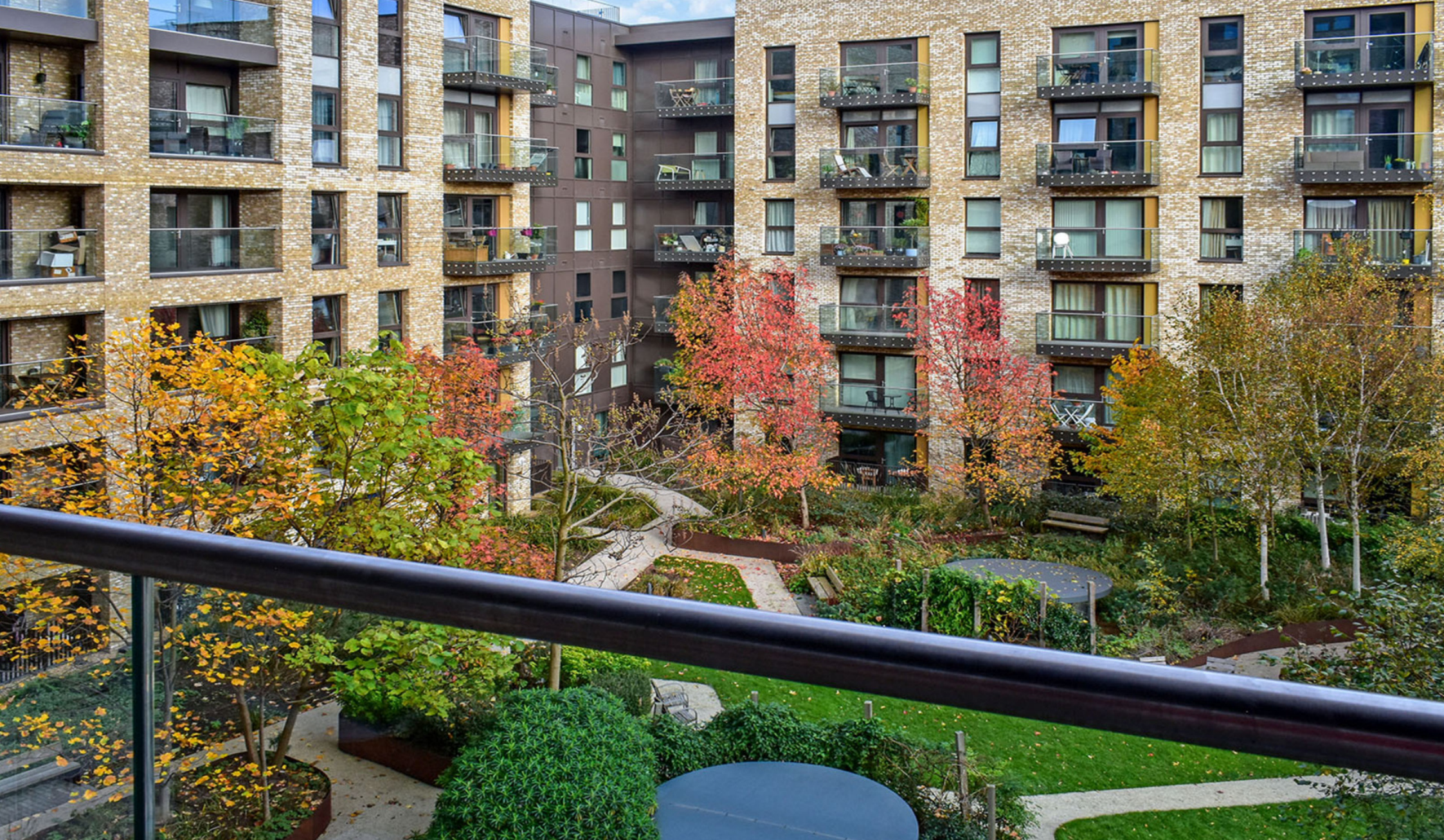
MALMO TOWER SE8 2 bedroom apartment