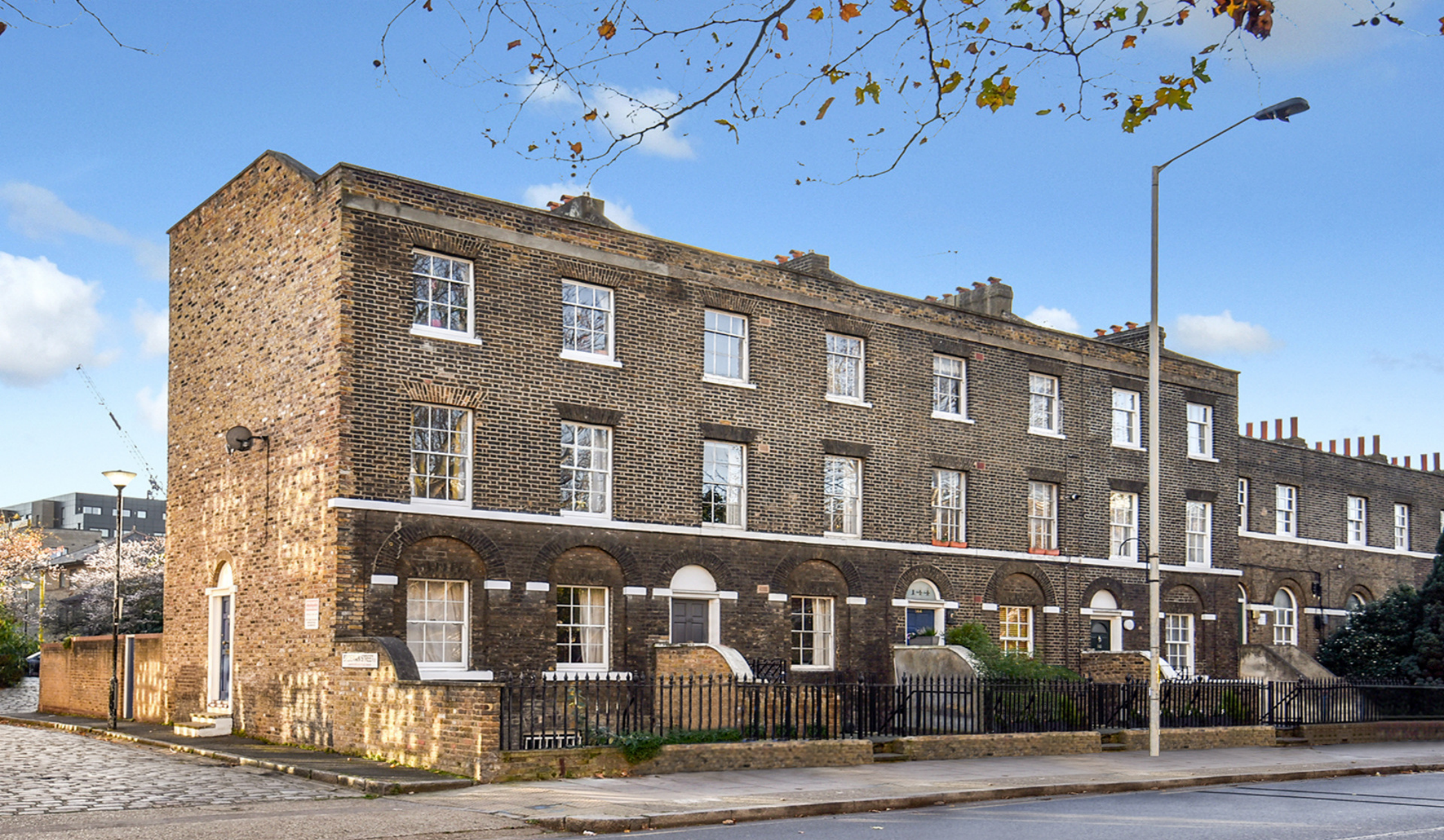
ABBAY STREET SE1 4 bedroom town house