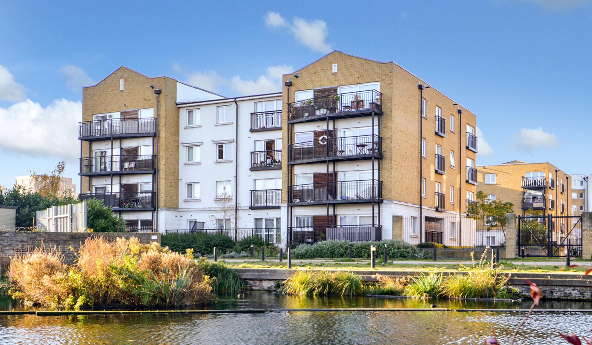
GRAY COURT E1 1 bedroom apartment