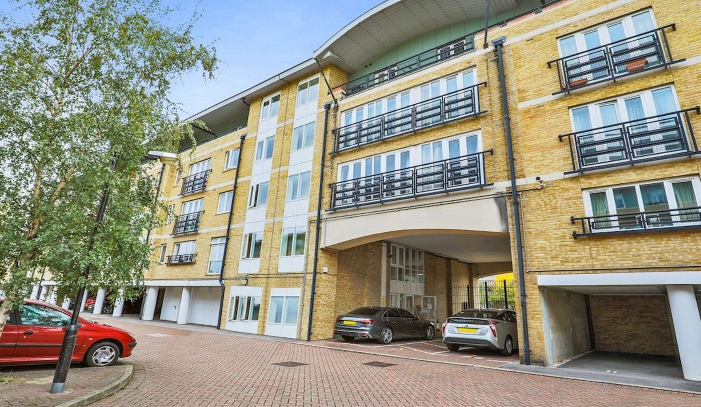
LOCKSONS CLOSE E14 2 bedroom apartment