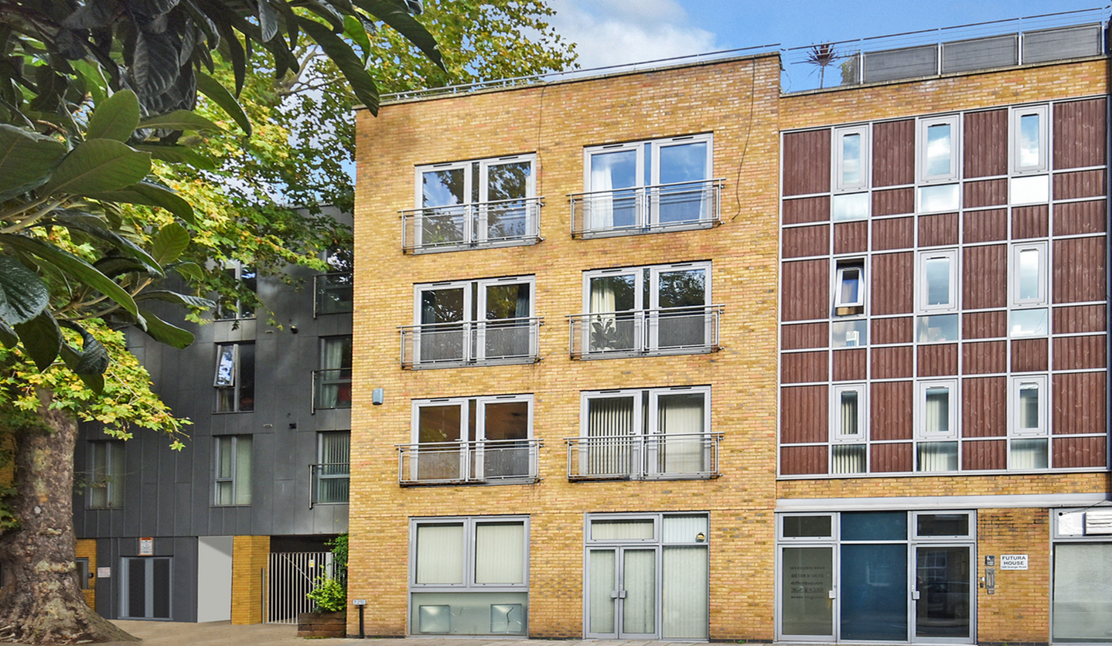
FUTURA HOUSE SE1 2 bedroom penthouse