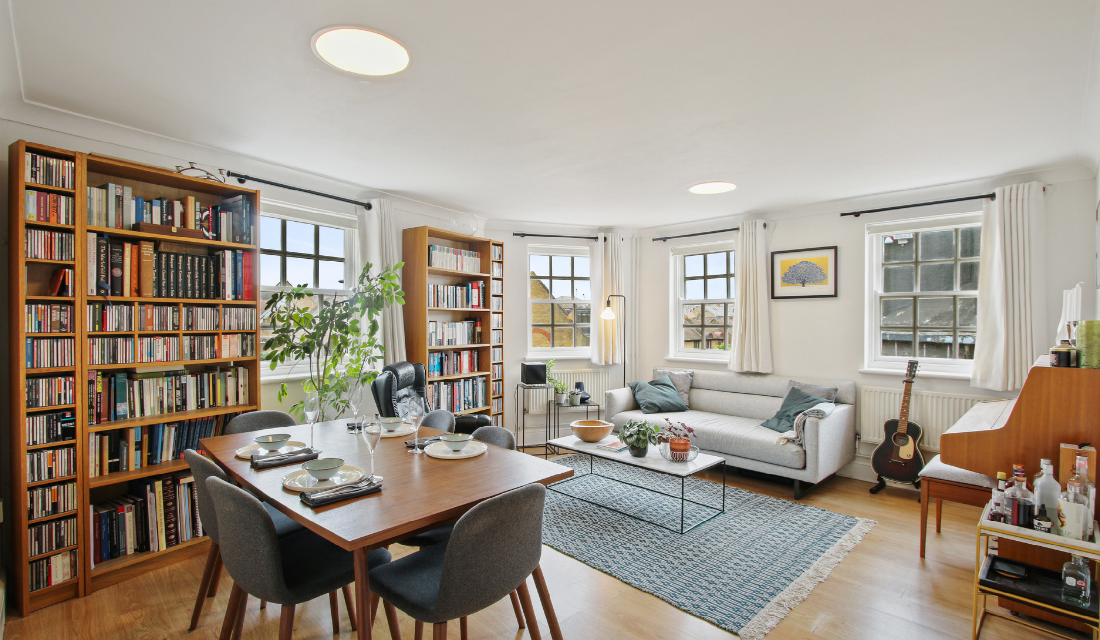
BRUNEL COURT SE16 2 bedroom apartment