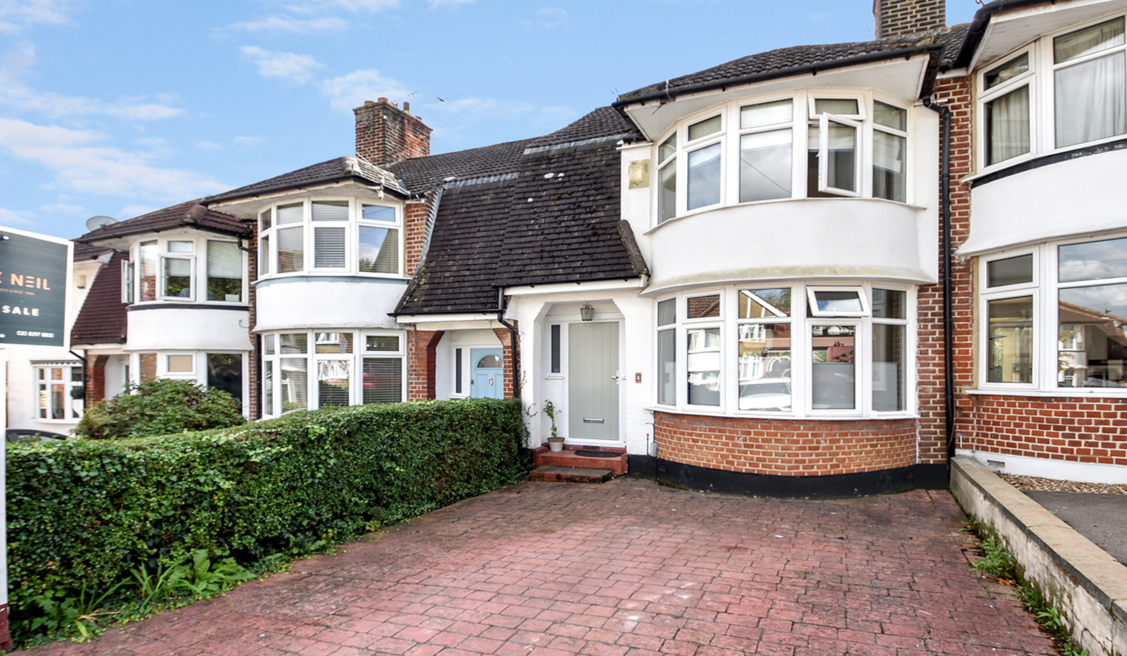
BARHAM CLOSE BR7 2 bedroom terraced house