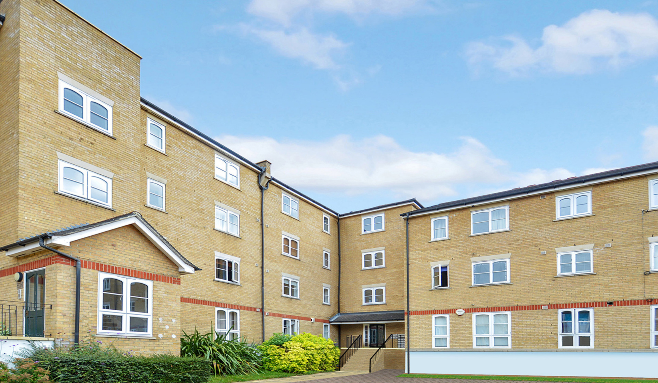
WHEAT SHEAF CLOSE E14 2 bedroom apartment