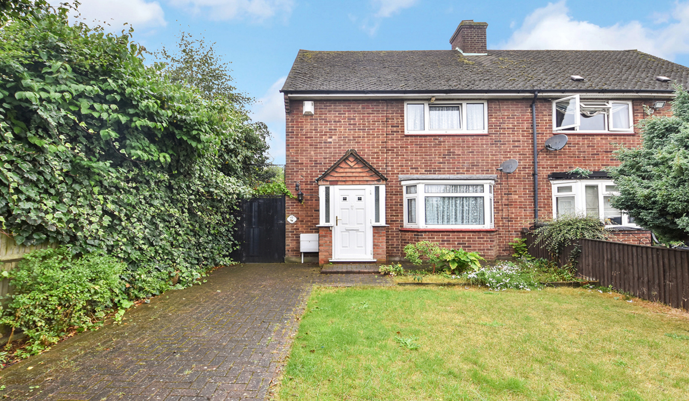
CHERRY AVENUE BR8 2 bedroom semi-detached house