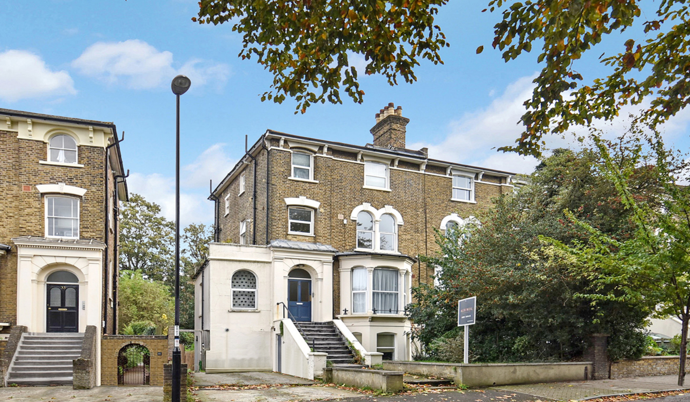
MANOR PARK SE13 1 bedroom apartment