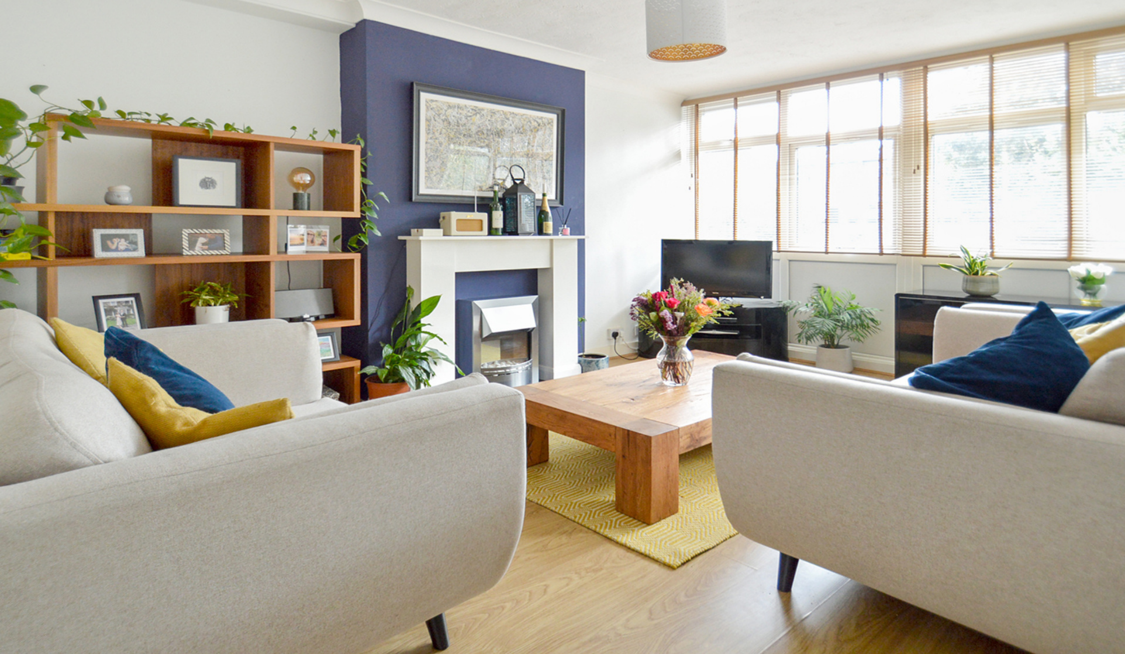
CLIPPER HOUSE E14 2 bedroom duplex apartment