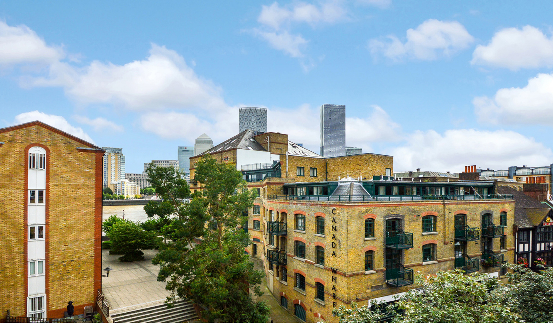
ELM COURT SE16 2 bedroom duplex apartment