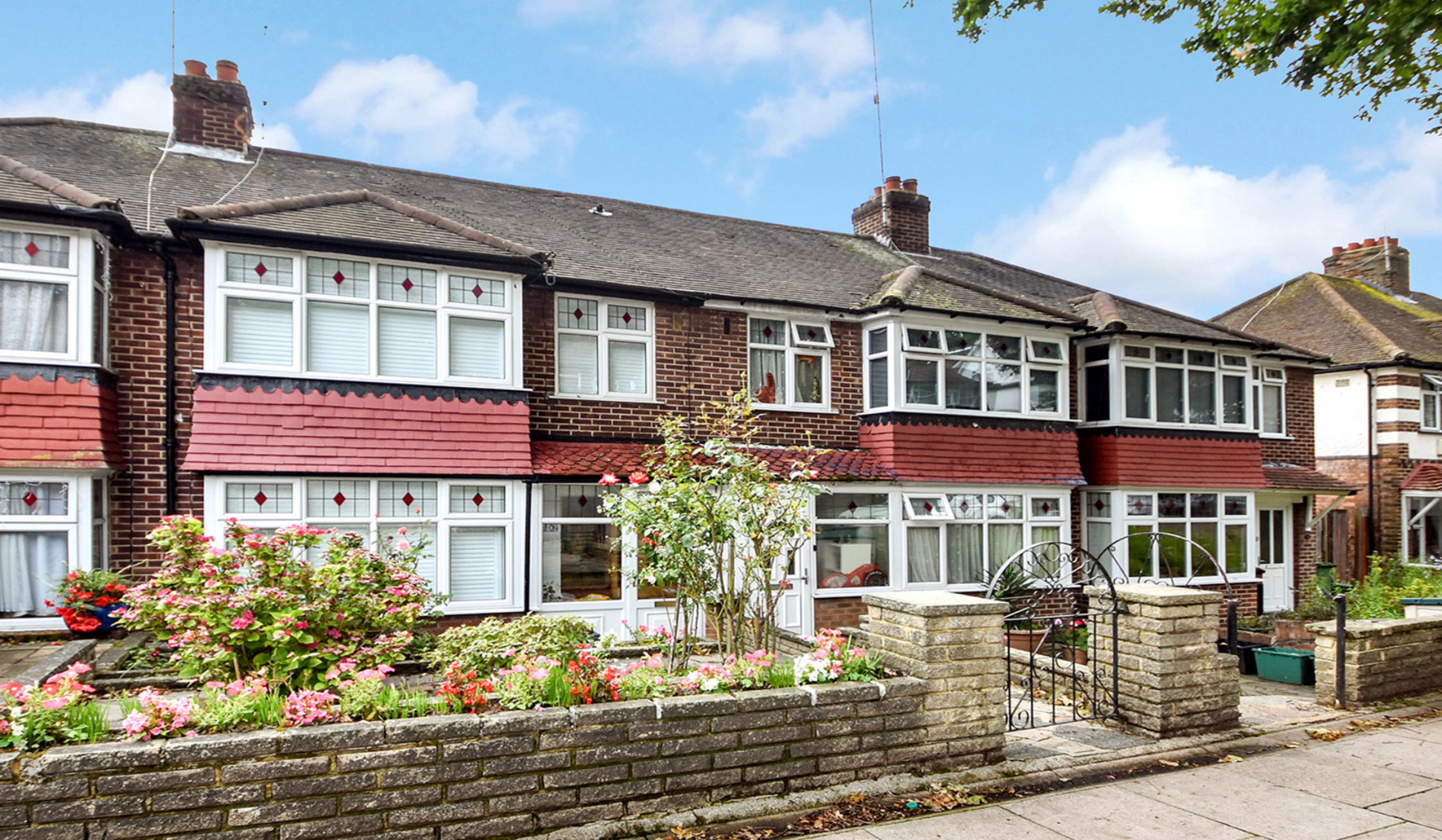
OAK TREE GARDENS BR1 3 bedroom terraced house