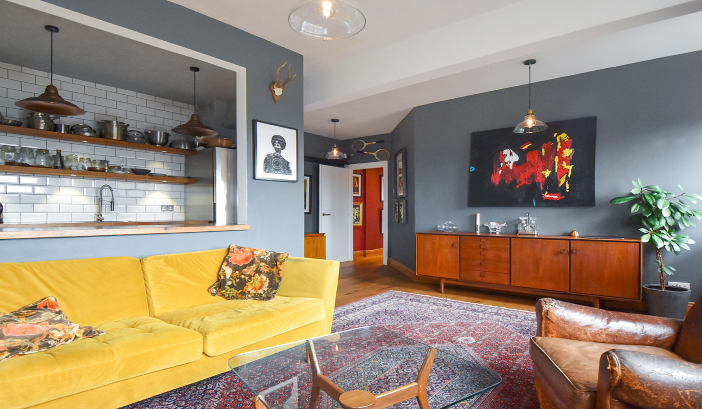
CITY VIEW HOUSE E2 2 bedroom apartment