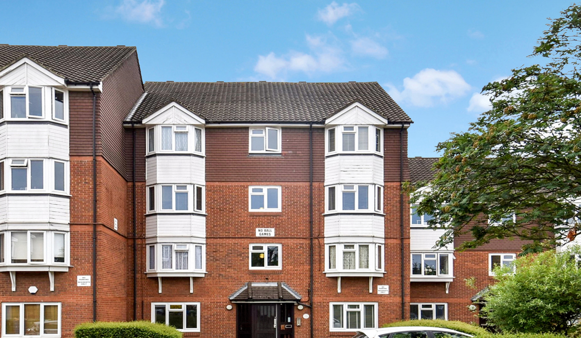
WEALD CLOSE SE16 2 bedroom apartment