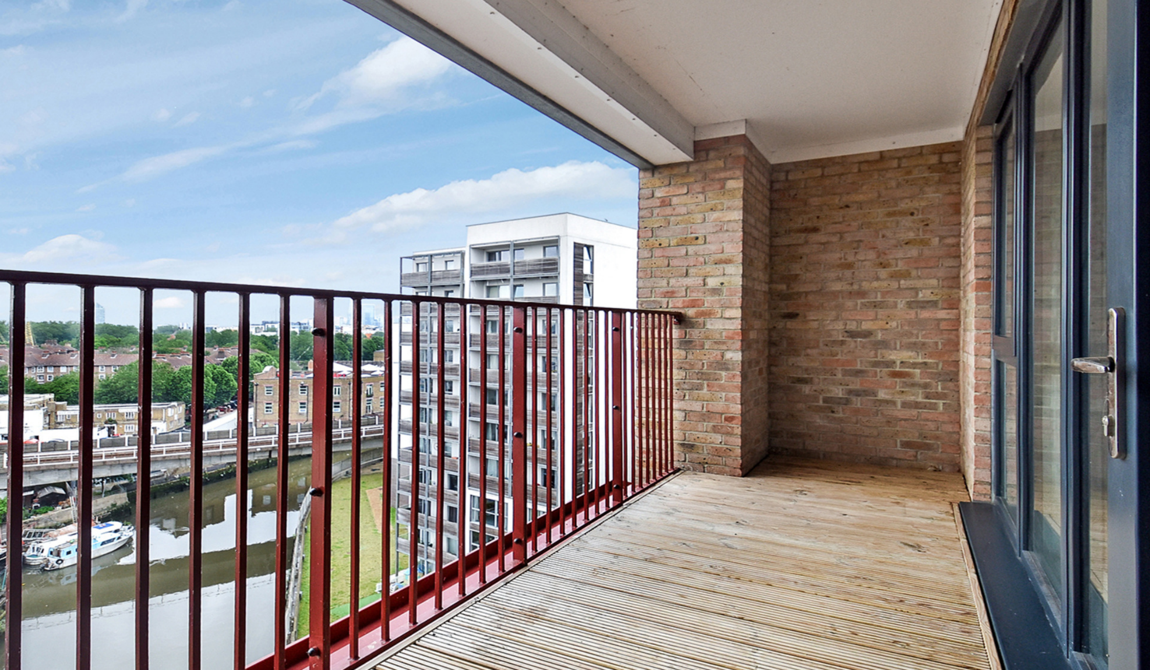
COWAN HOUSE SE10 2 bedroom apartment