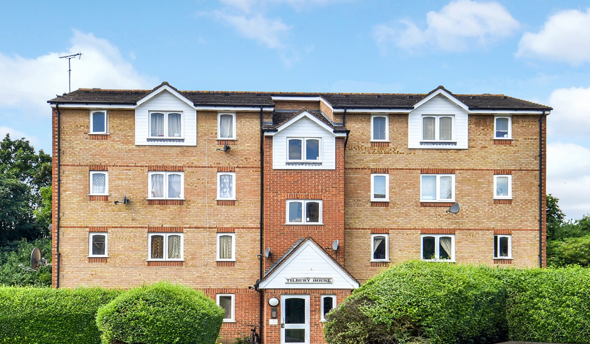
TILBURY HOUSE SE14 studio apartment