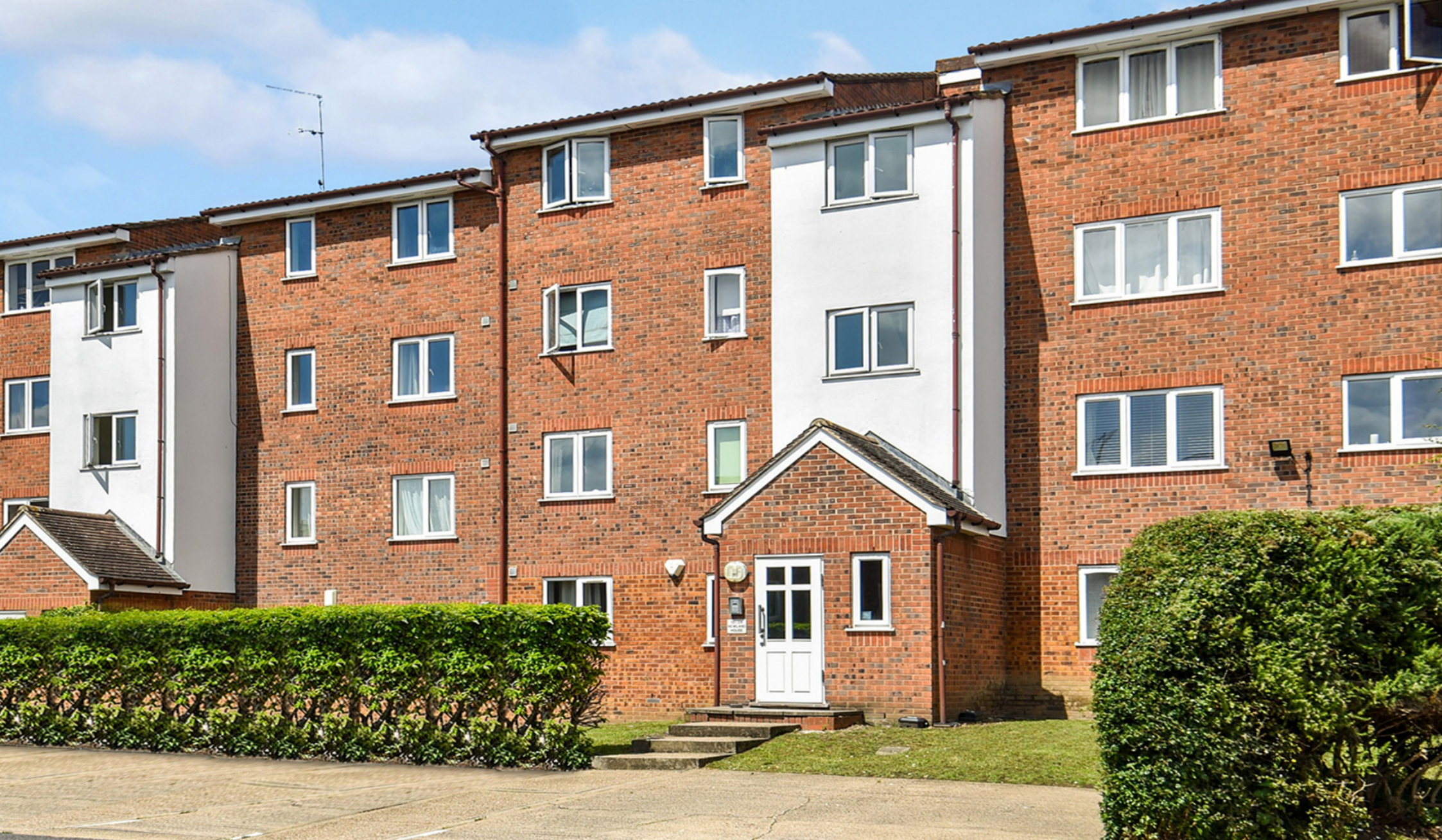
NEWLAND HOUSE SE14 studio apartment