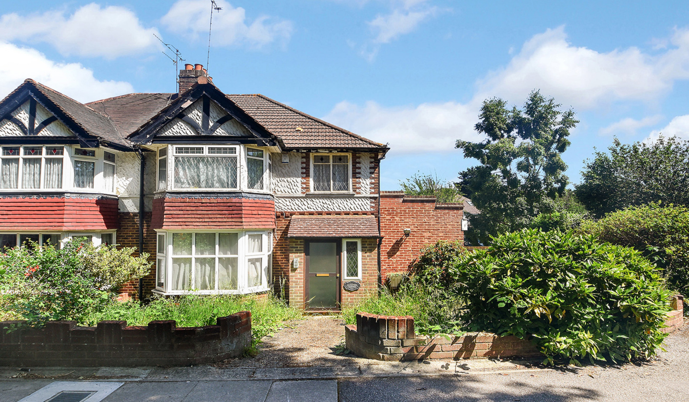
OAK TREE GARDENS BR1 3 bedroom semi-detached house