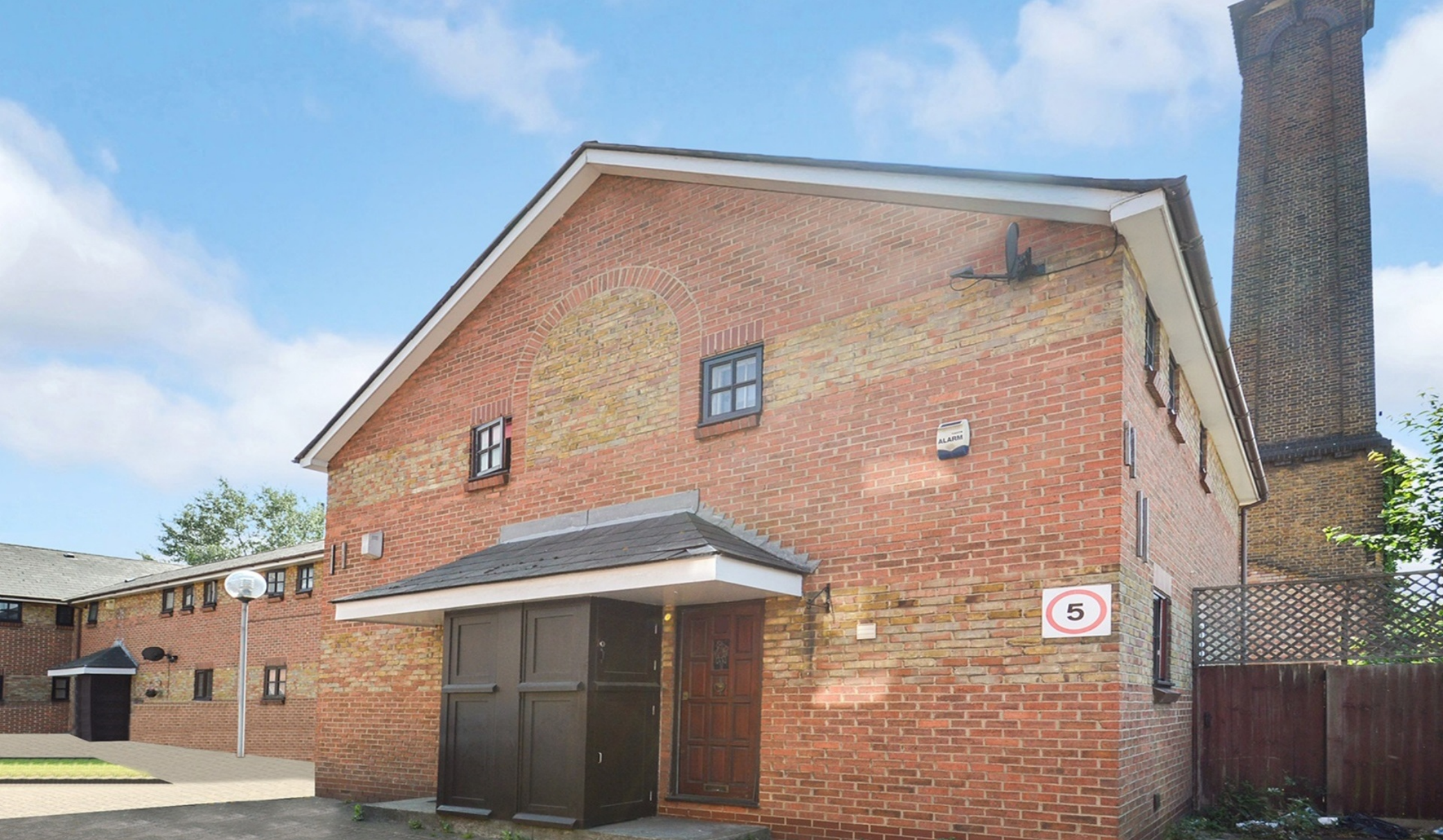
ATHOL SQUARE E14 2 bedroom terraced house