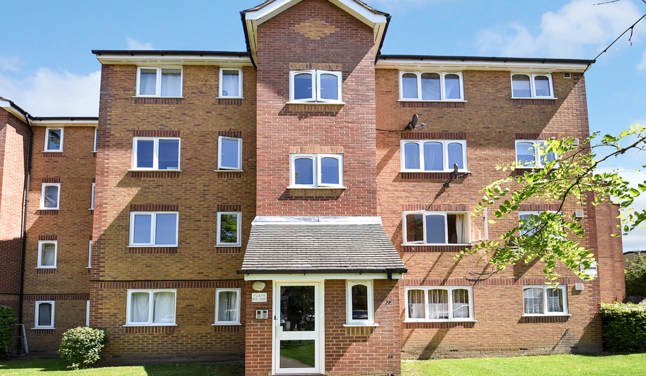
INWEN COURT SE8 studio apartment