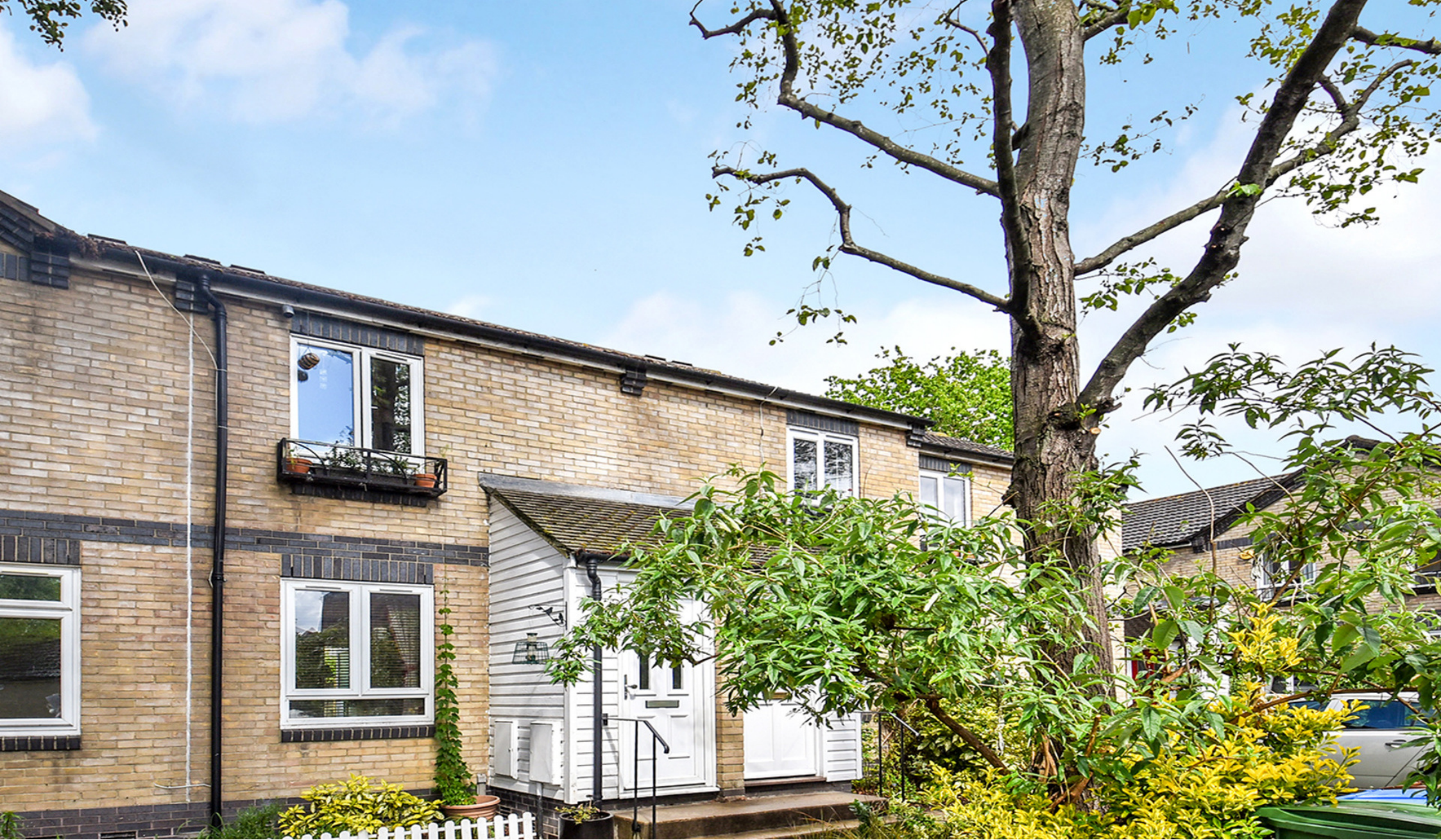
RADLEY COURT SE16 2 bedroom terraced house