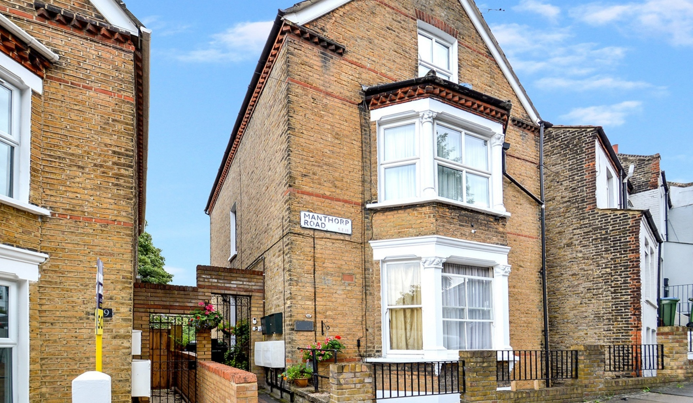
MANTHORPE ROAD SE18 2 bedroom duplex apartment