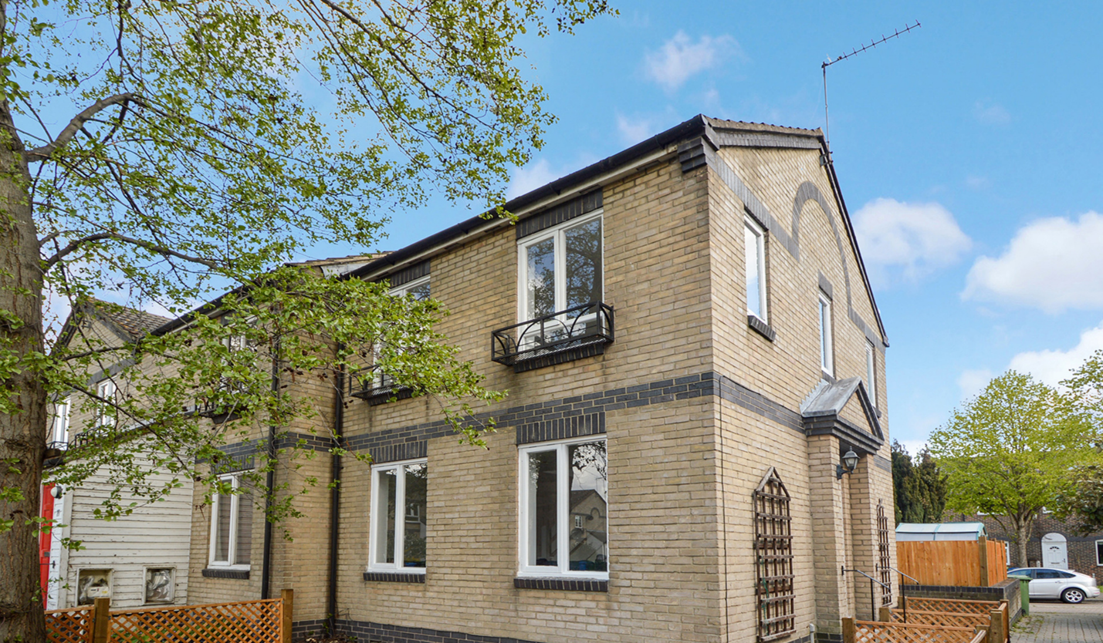
RADLEY COURT SE16 2 bedroom end of terrace