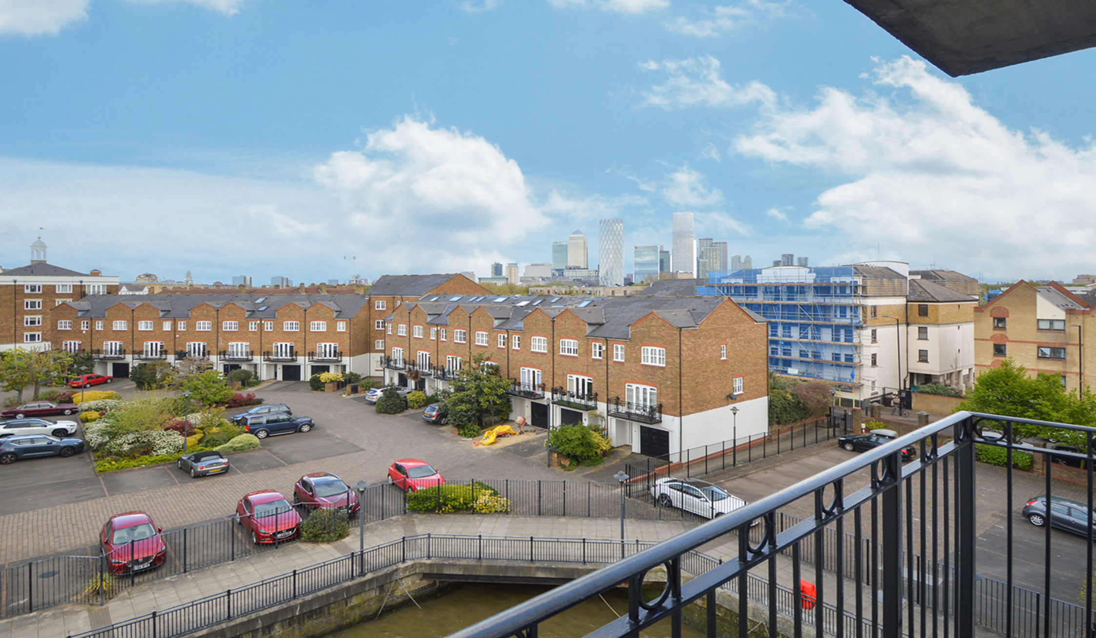
LEESIDE COURT SE16 2 bedroom apartment