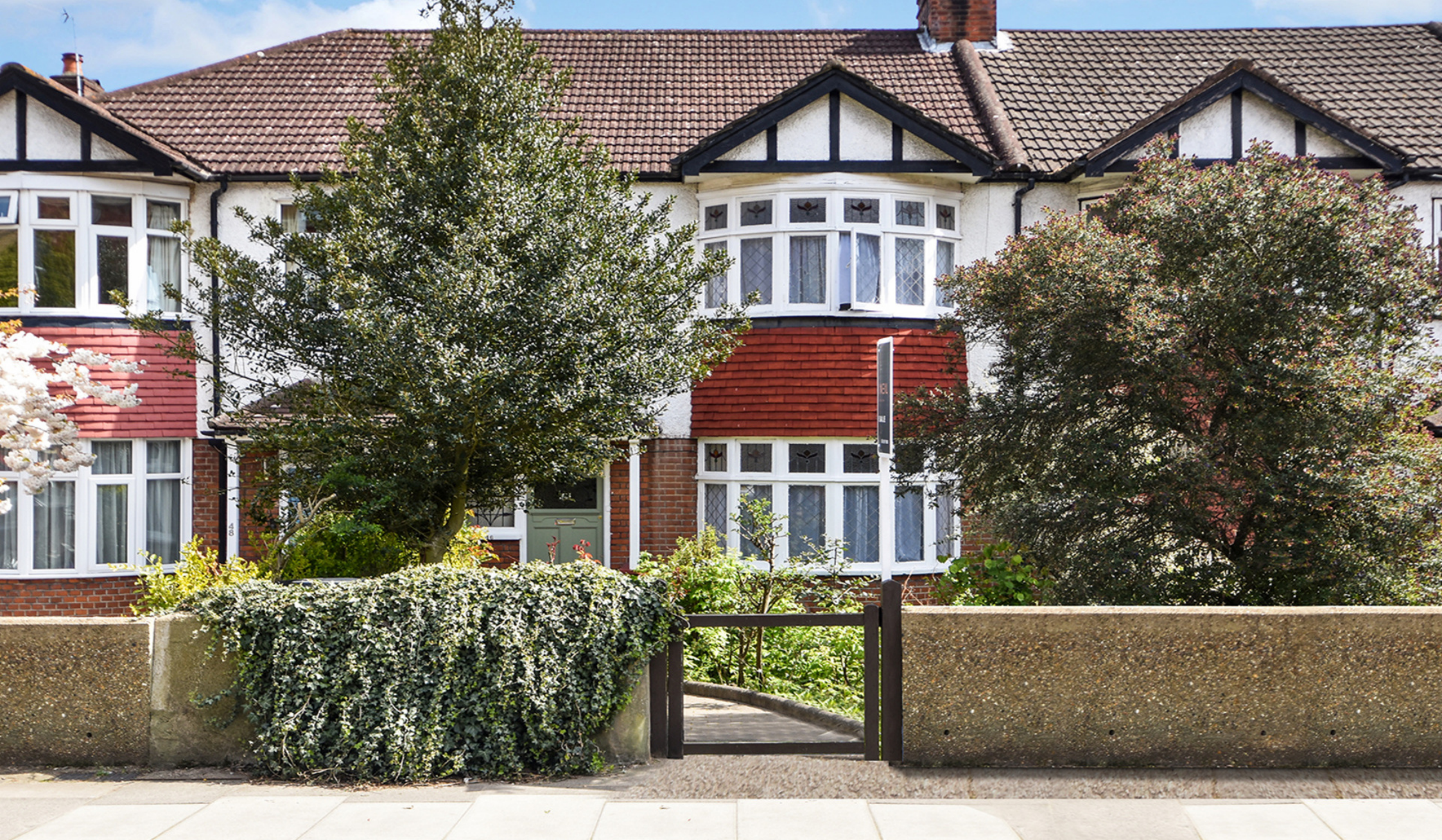
ANERLEY PARK SE20 3 bedroom terraced house