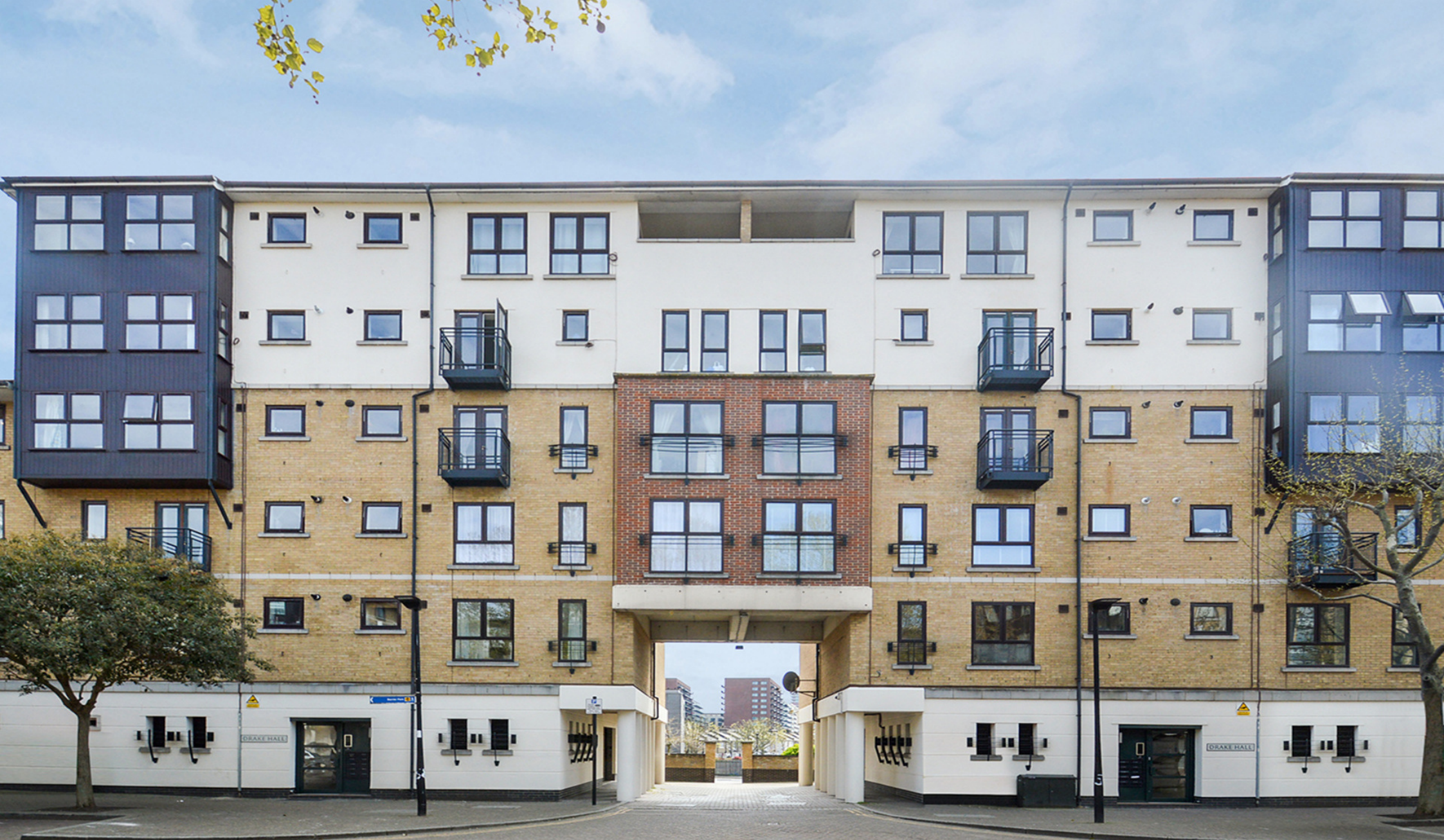
DRAKE HALL E16 2 bedroom apartment