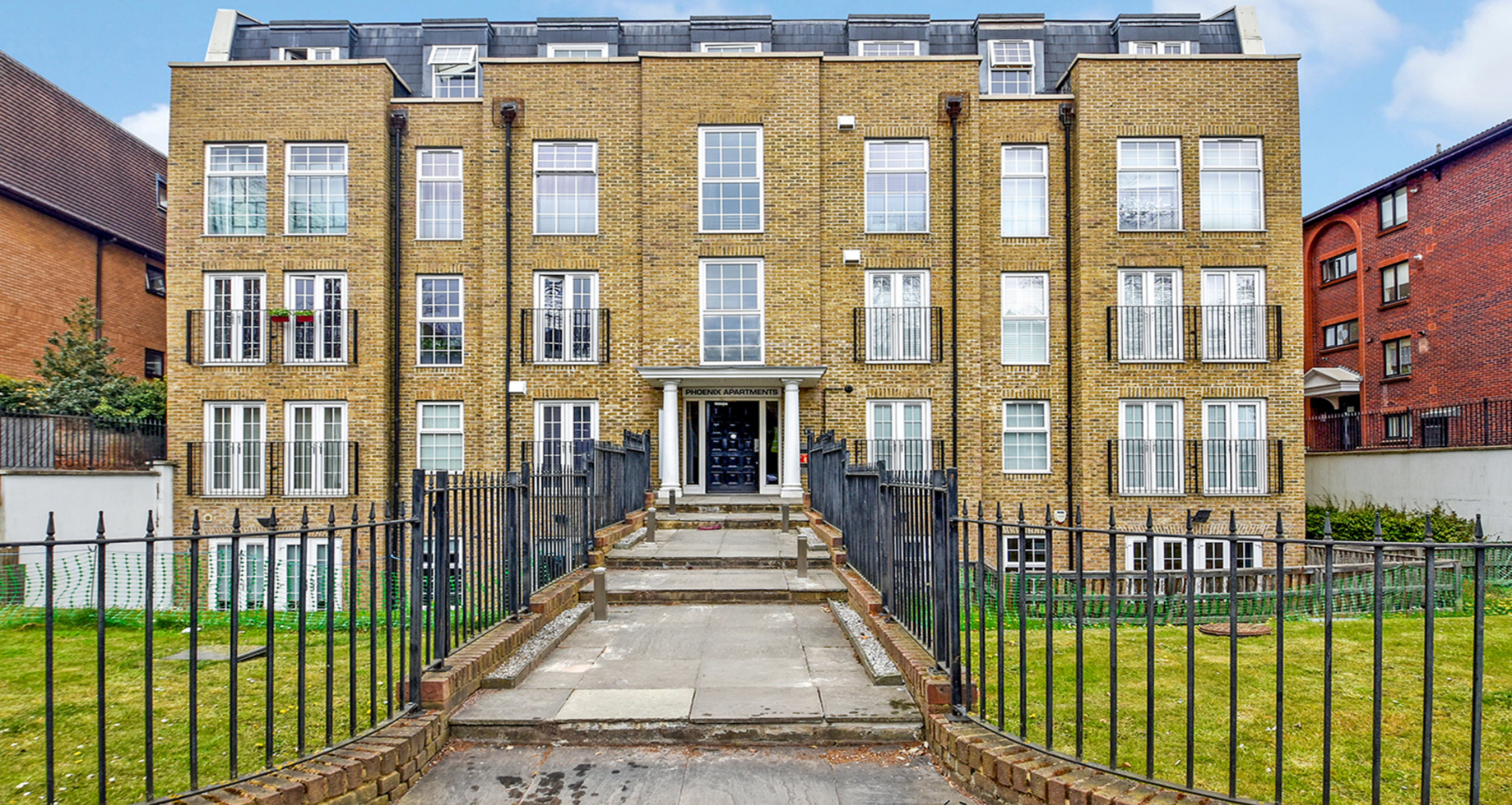
PHOENIX APARTMENTS BR1 2 bedroom apartment