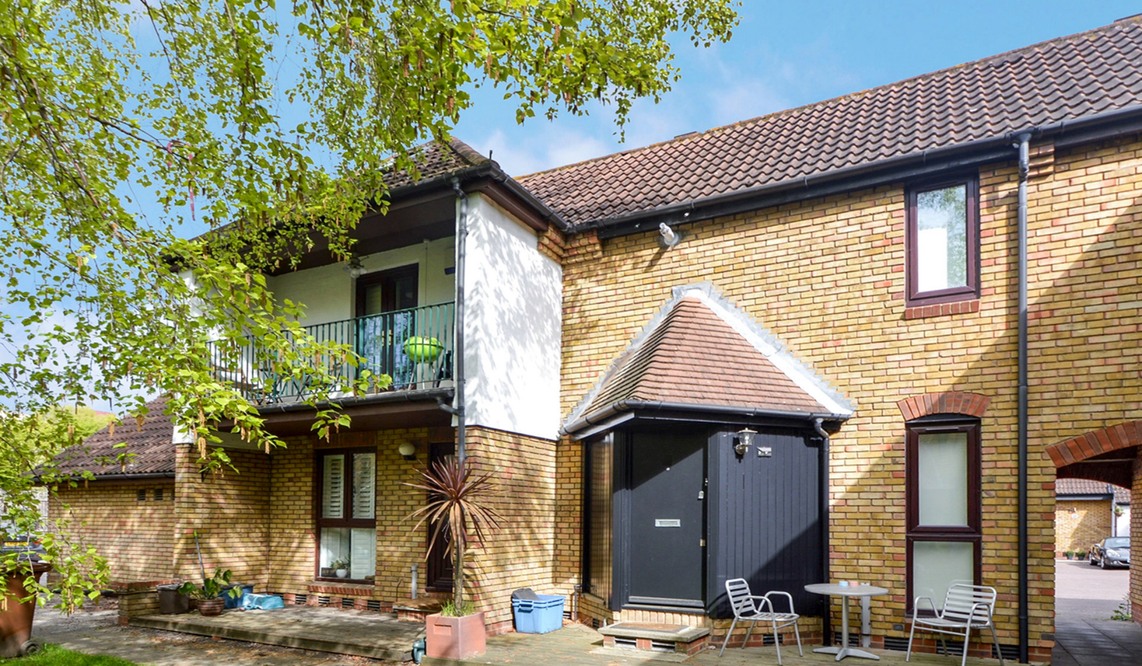
REVELEY SQUARE SE16 1 bedroom terraced house