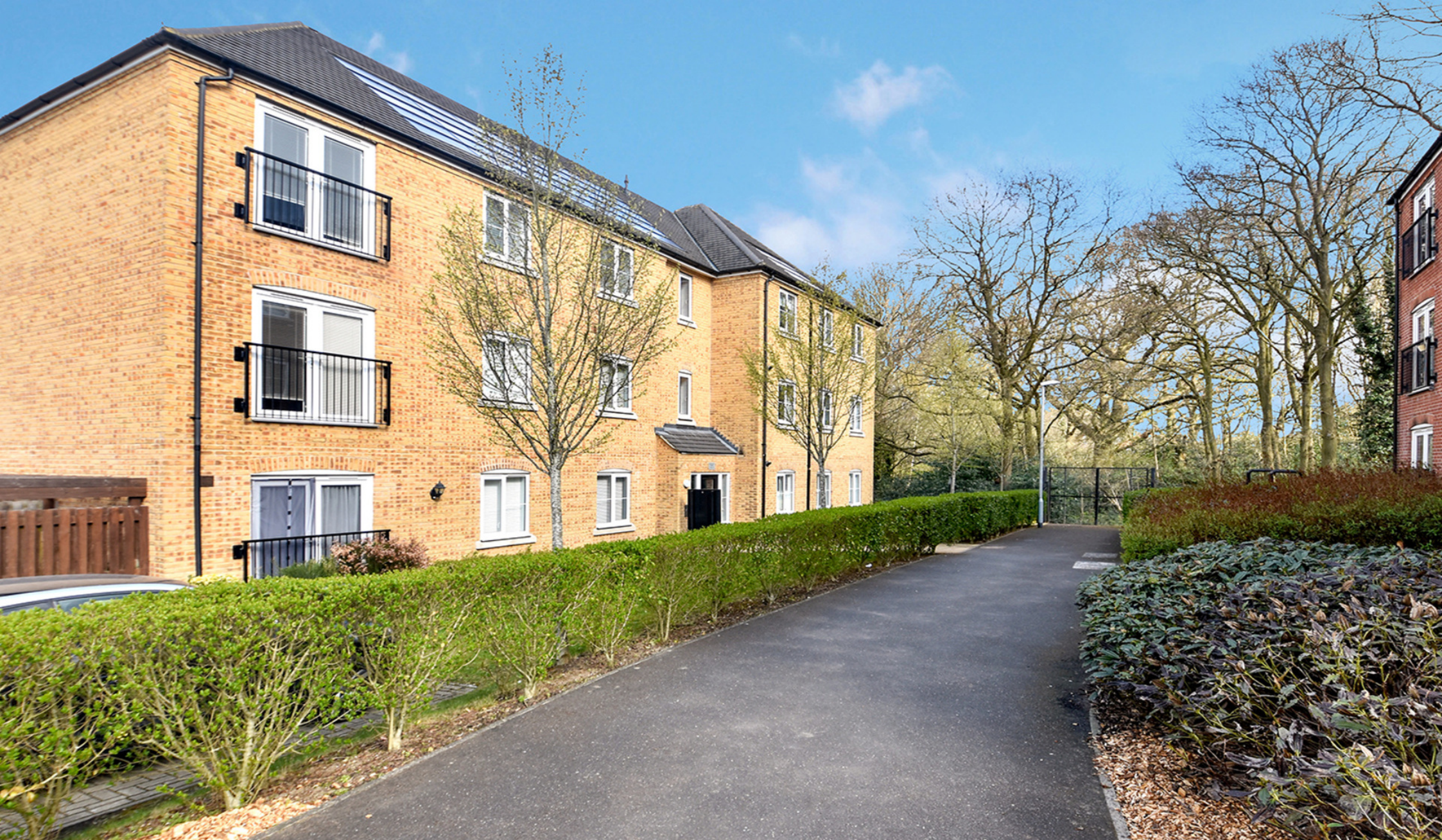
WARKWORTH HOUSE BR7 2 bedroom apartment