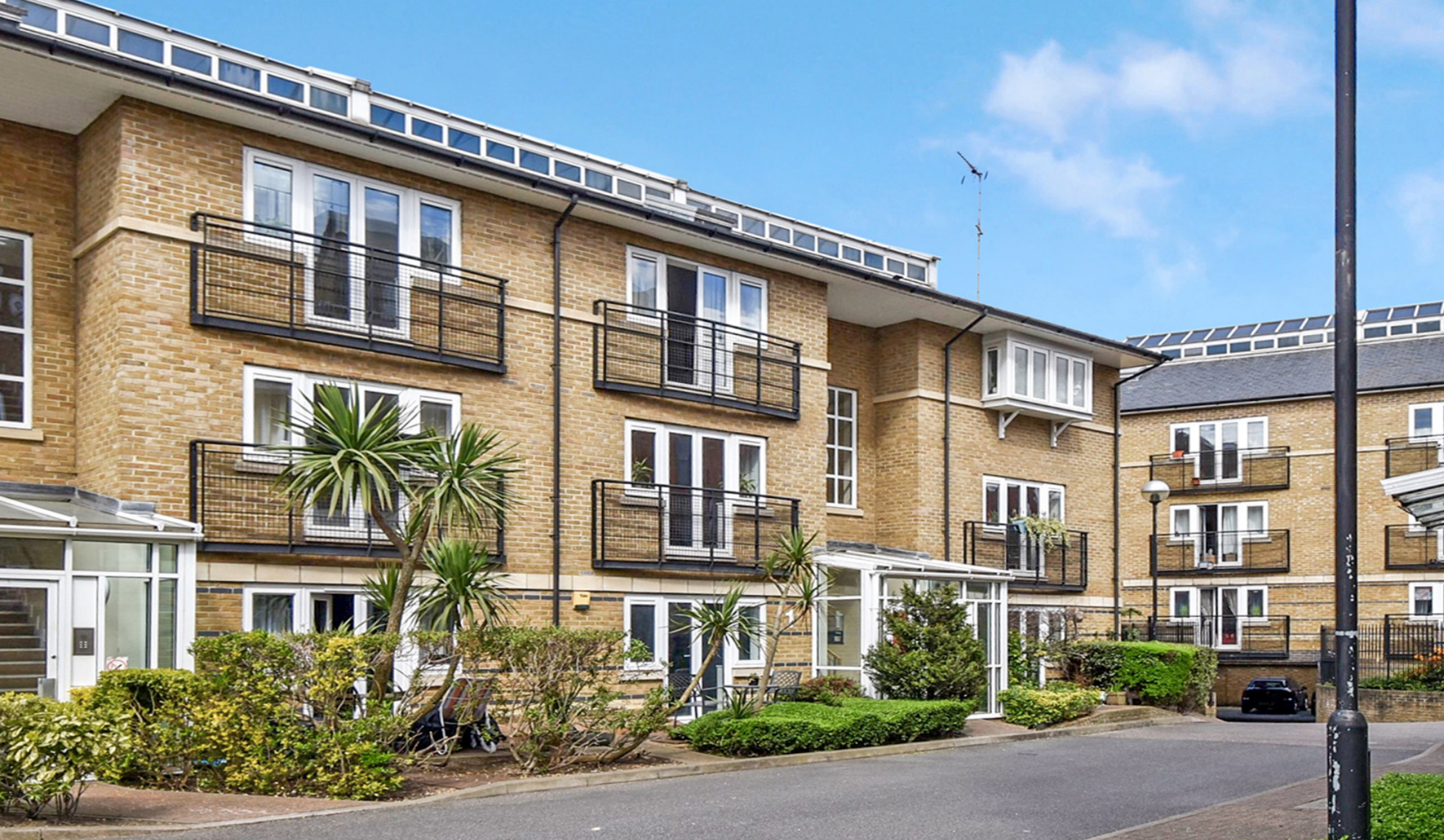
MENAI PLACE E3 2 bedroom apartment