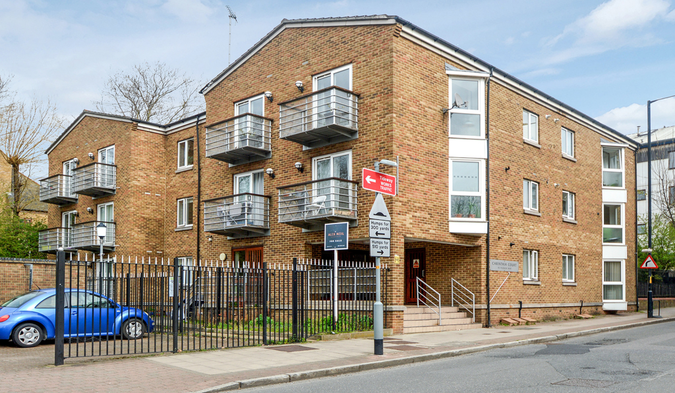
CARINTHIA COURT SE16 3 bedroom apartment