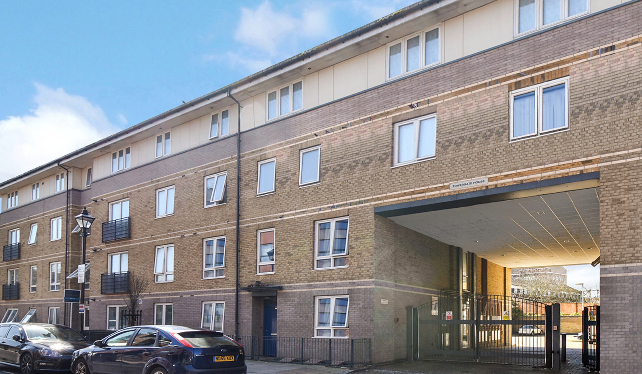
TOWERGATE HOUSE E3 1 bedroom apartment