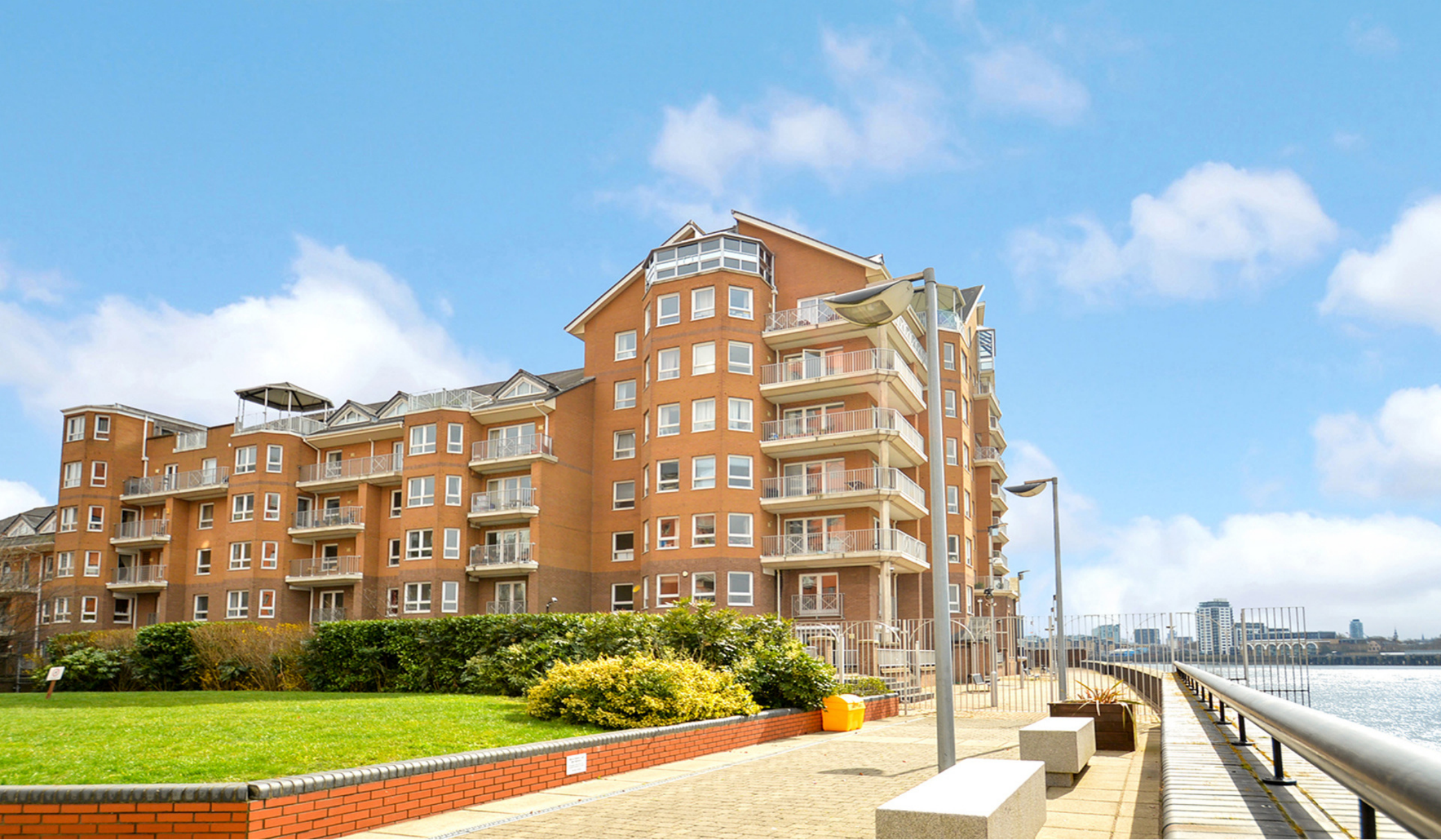
HERA COURT E14 1 bedroom apartment