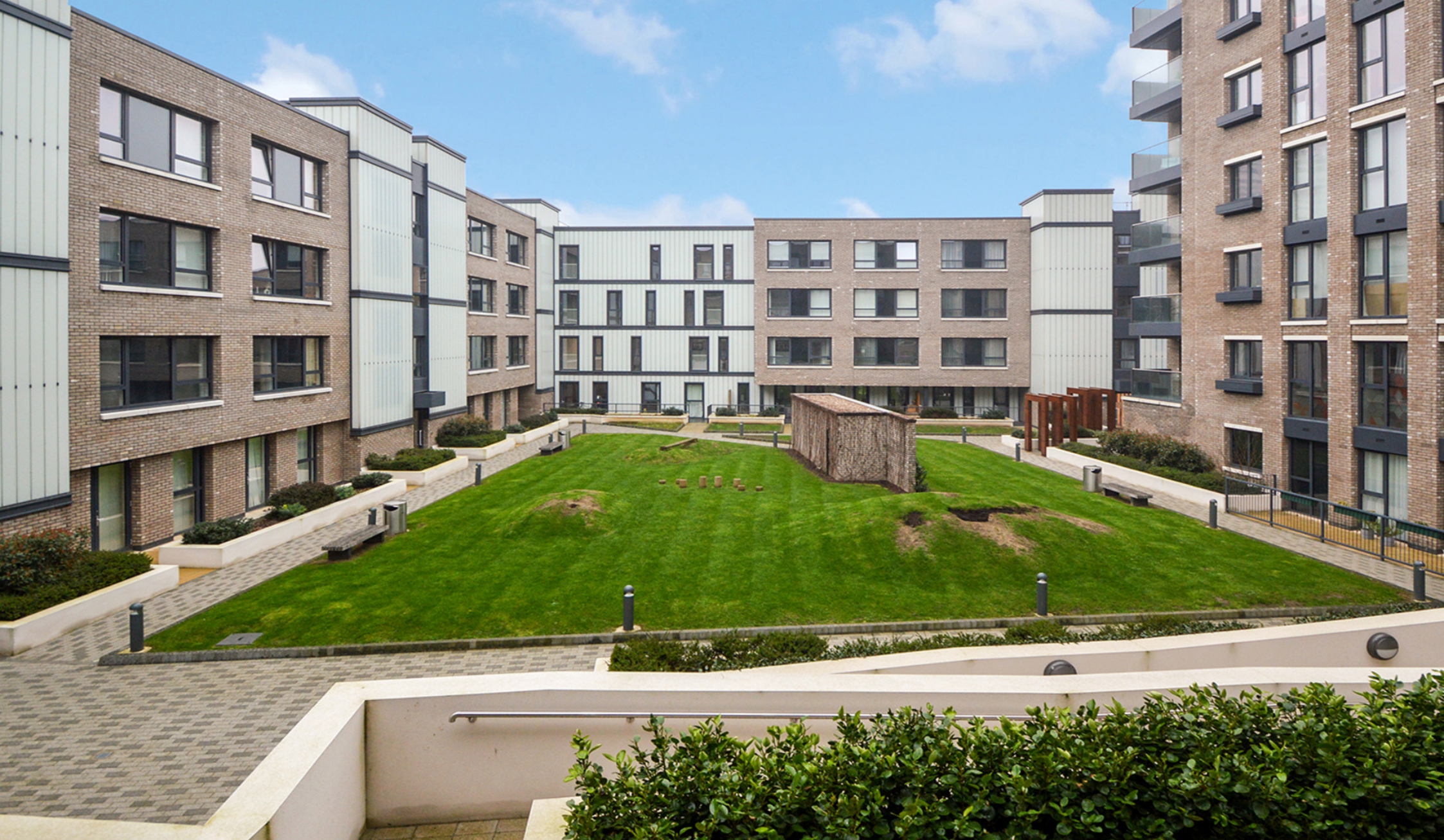
AURORA POINT SE16 3 bedroom apartment