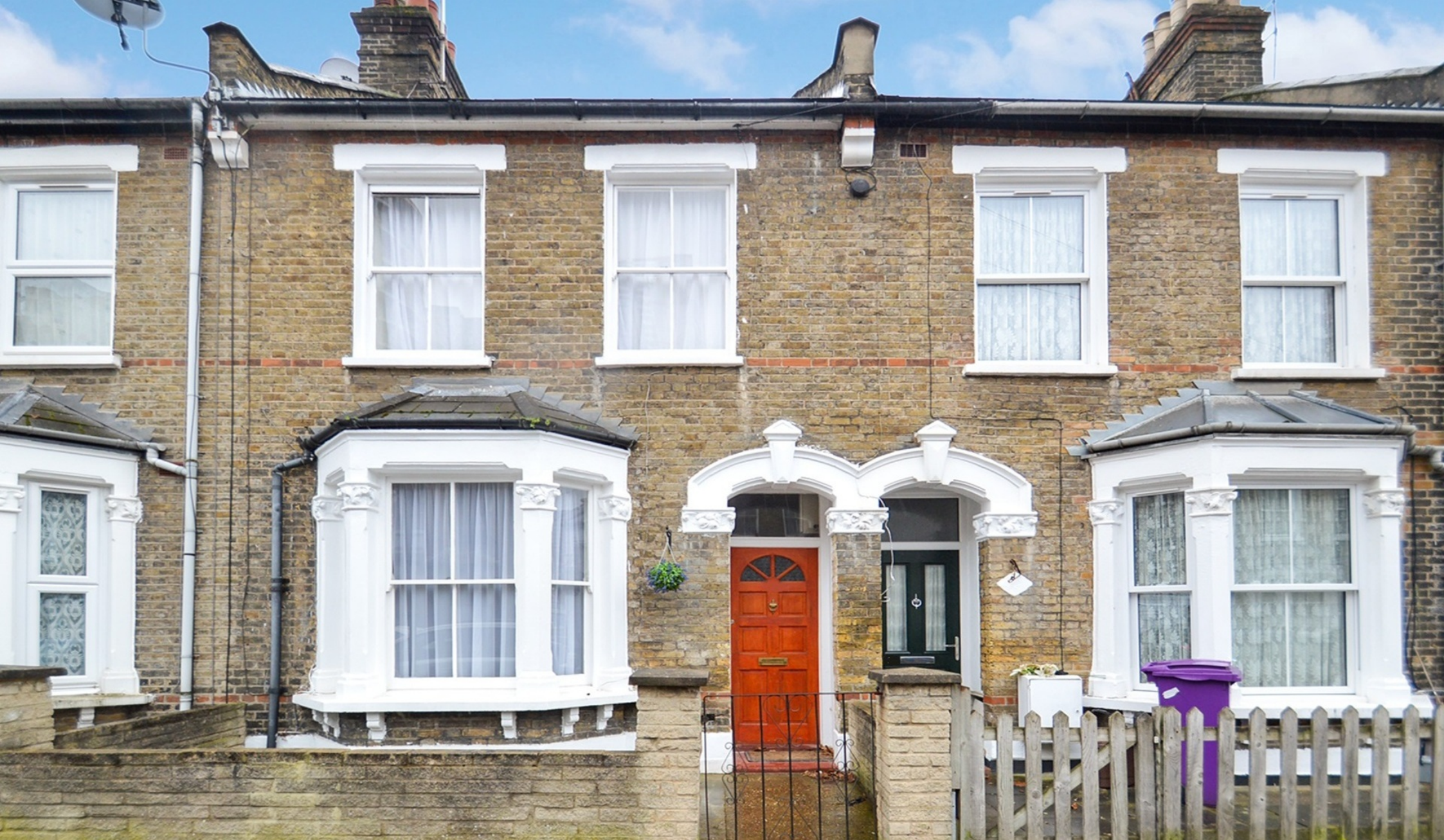
MELLISH STREET E14 4 bedroom terraced house