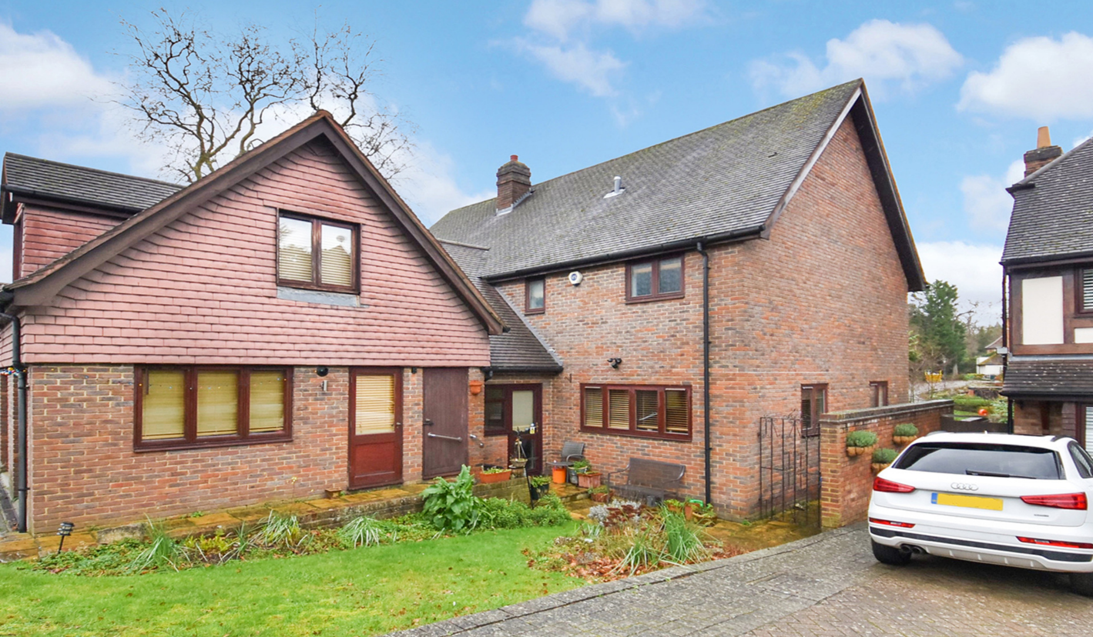
KESTON PARK CLOSE BR2 5 bedroom detached house