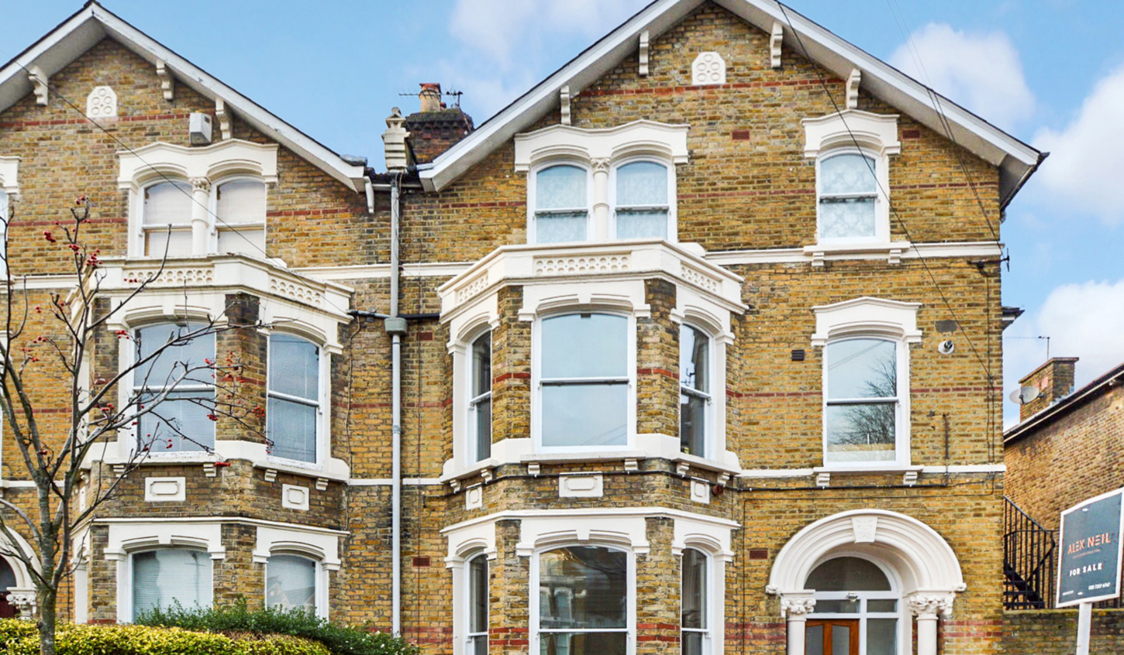
TRESSILLIAN ROAD SE4 2 bedroom apartment