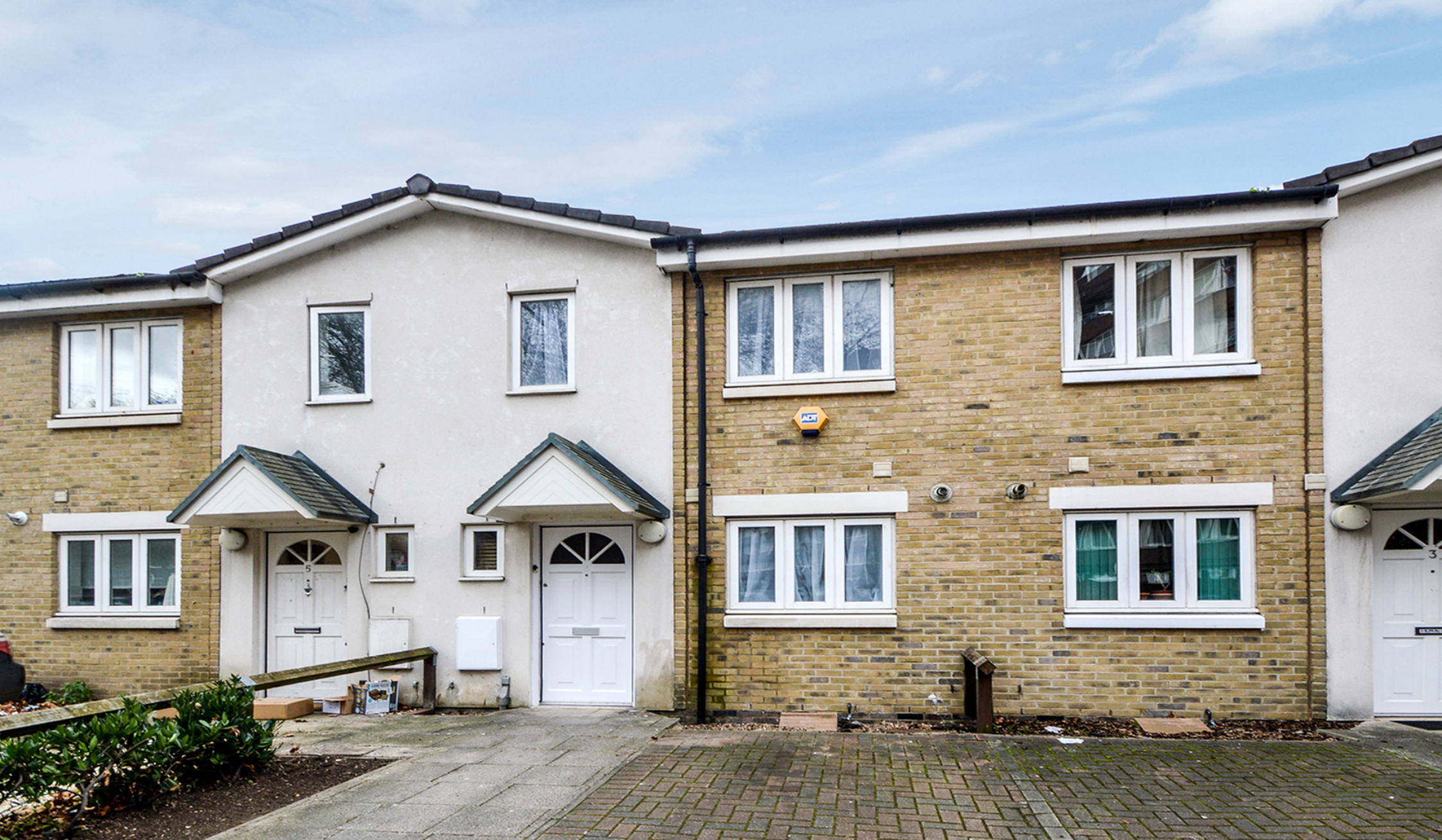
SAPPHIRE ROAD SE8 2 bedroom terraced house