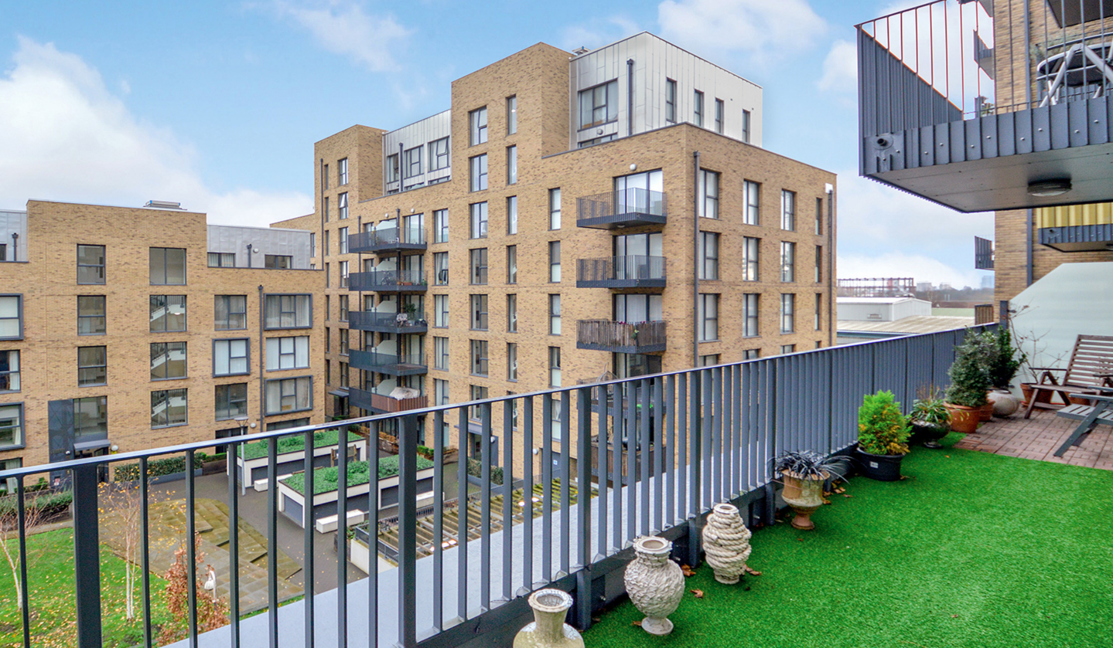
BERGER COURT E3 2 bedroom apartment