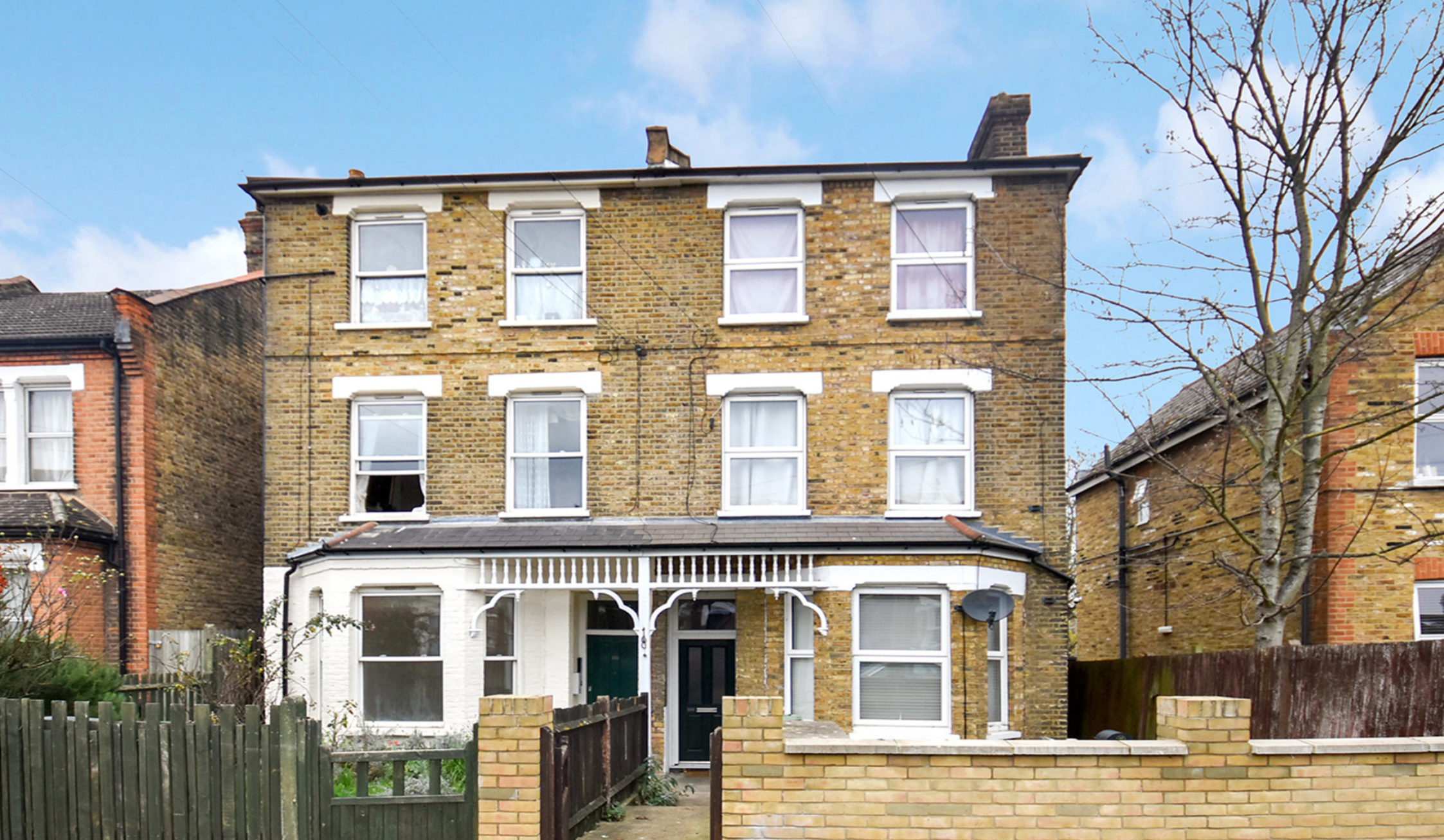
MACKENZIE ROAD BR3 1 bedroom apartment