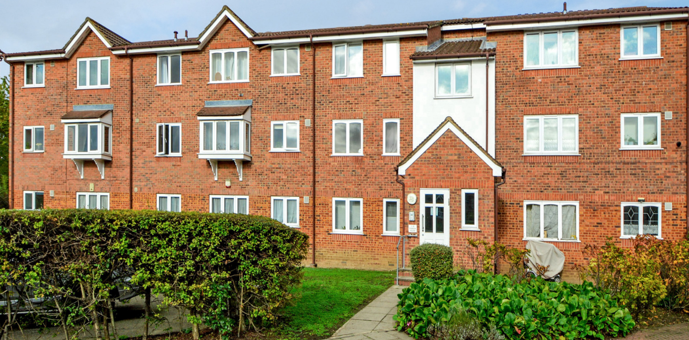
DOBSON HOUSE SE14 studio apartment