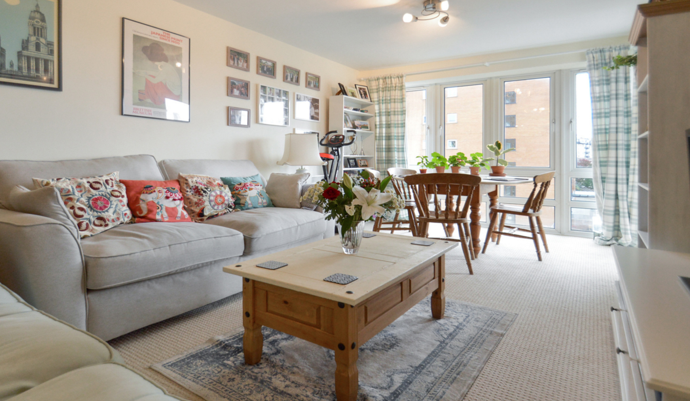
JUPITER HOUSE E14 2 bedroom apartment