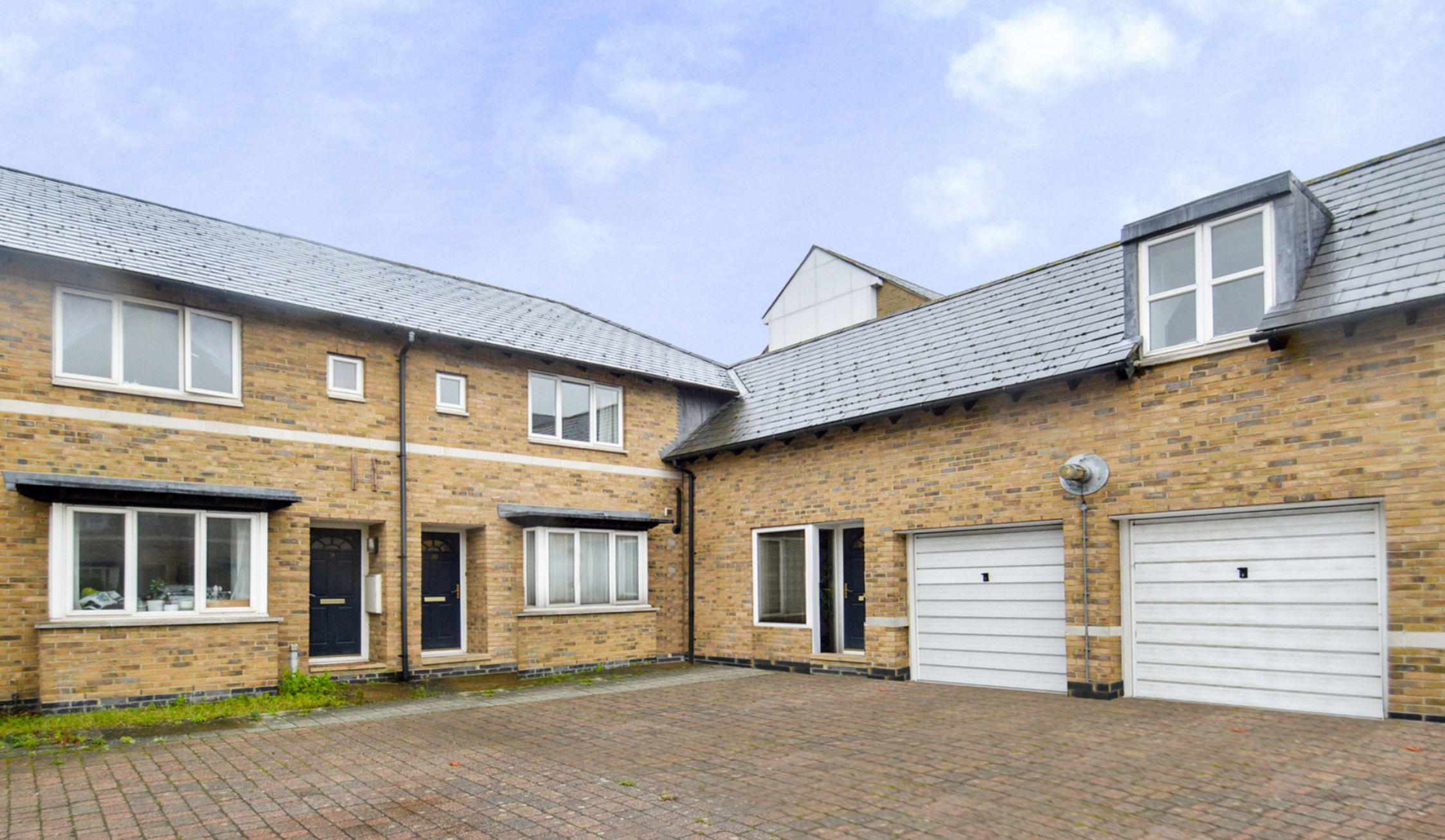
MAGELLAN PLACE E14 2 bedroom terraced house