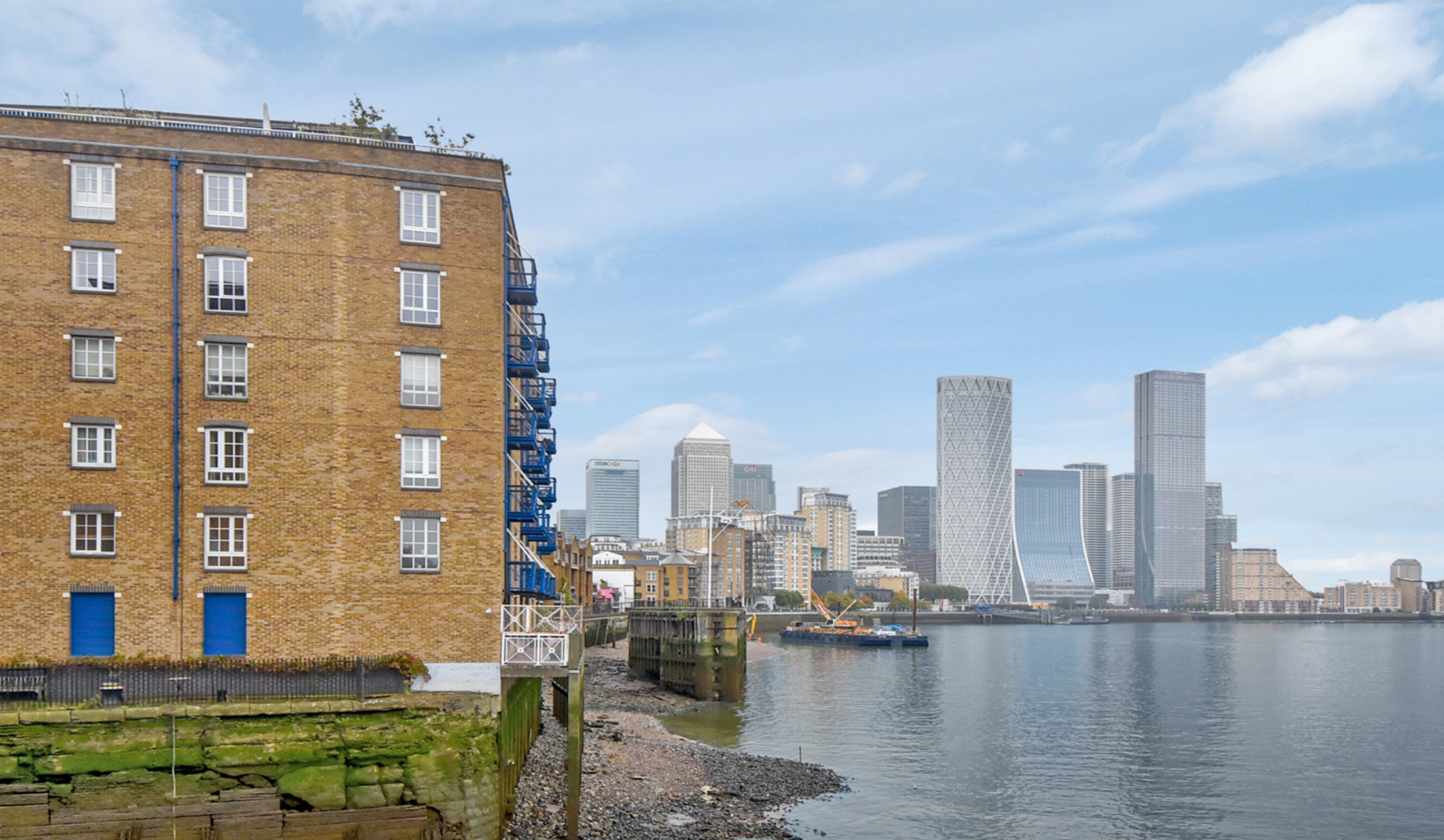
PAPERMILL WHARF E14 1 bedroom apartment