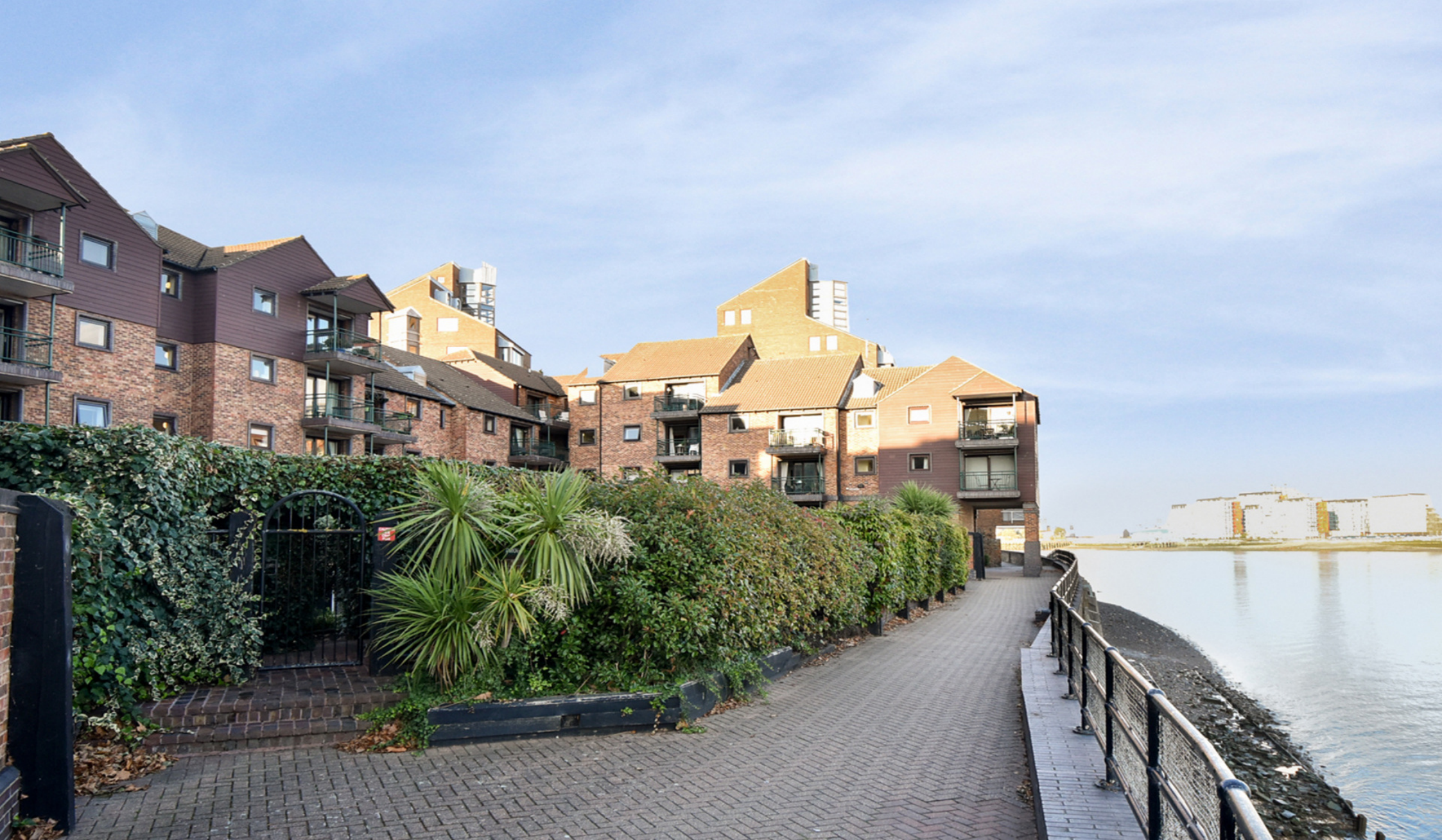
LURALDA WHARF E14 2 bedroom apartment