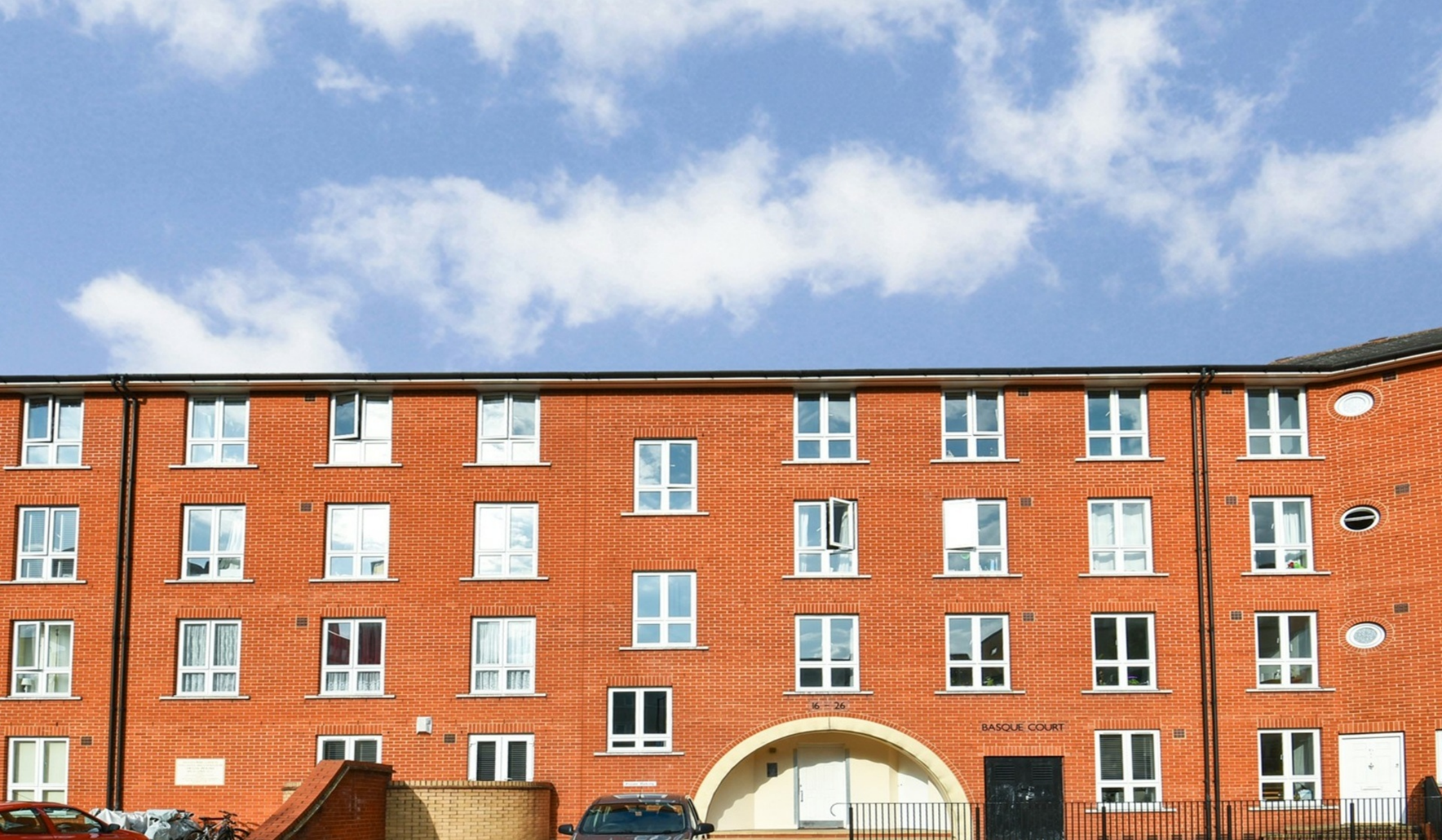
BASQUE COURT SE16 1 bedroom apartment