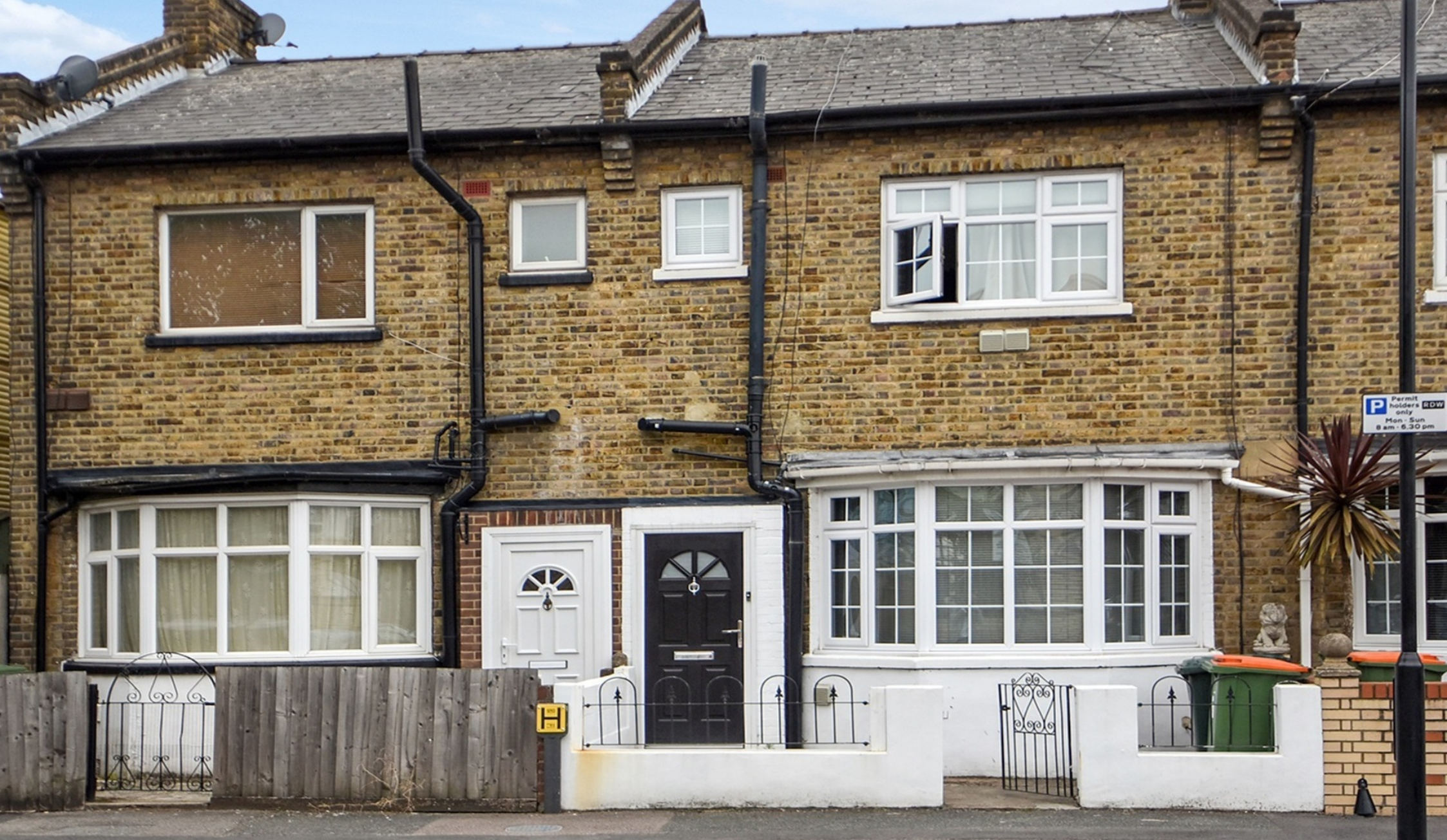
BOXLEY STREET E16 3 bedroom end of terrace